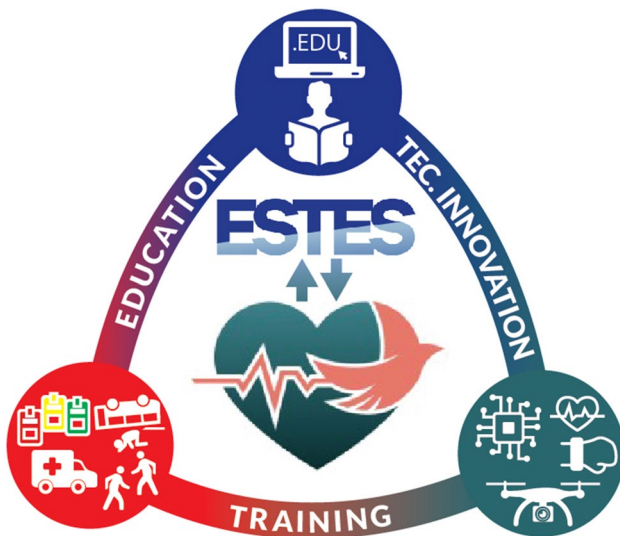
Fig. 2 Integration of education, training, and technological innovations as key elements of the ESTES-NIGHTINGALE project cooperation