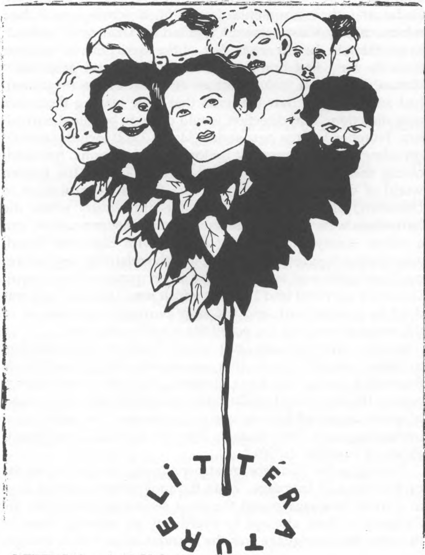
This ironic portrait of some of the Paris Dadaists by Francis Picabia appeared on the cover of Littérature n.s. no. 8 (January 1923).