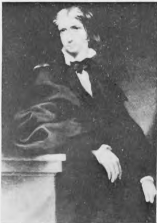
LEIGH HUNT, by MARGARET GILLIES