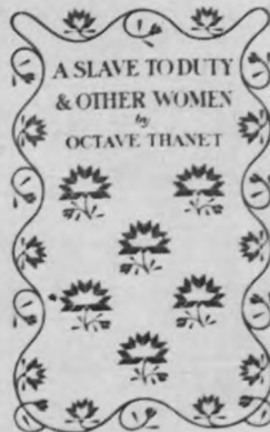
Three books by Octave Thanet (Alice French) from the Iowa Authors Collection. A Book of True Lovers (Chicago: Way and Williams, 1897); The Heart of Toil (New York: International Association of Newspapers and Authors, 1901); and A Slave to Duty & Other Women (Chicago: Herbert S. Stone & Company, 1898).