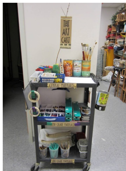
FIGURE 2B: AFTER

Such accommodations make the cart functional as a mobile interface with each of the classrooms Karen teaches in making it more conducive to her teaching tasks. Karen also had to learn to strategically interact with the art rooms between classes...how to move the cart from room to room—how fast, which route, where to position the cart (See FIGURE 3).