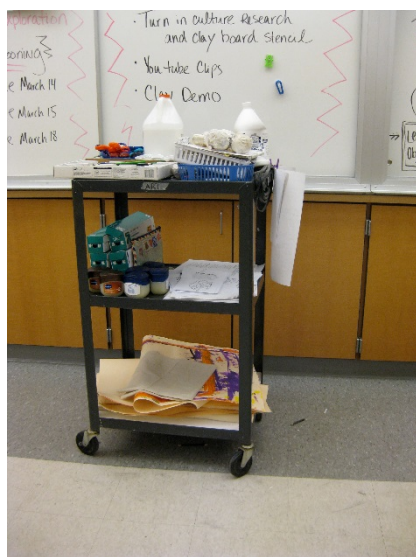
FIGURE 2A. A: BEFORE

Karen works from a repurposed overhead projector cart with three shelves. It is top-heavy, and often too small to accommodate the supplies she needs for multiple classes with upwards of 30 students. She says of her cart: "It's very hard to organize things on it...because there aren't any compartments or anything on it. Or not even a ledge on the edge to keep things from falling off" (Karen, February 18). To make the cart functional Karen chose to augment the cart with magnetic hooks, zip-tied mail slots, and bins and labels (see Figures 2a and 2b).