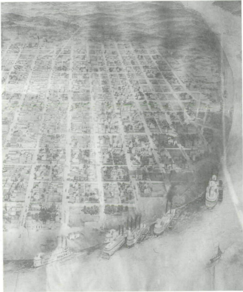
This lithograph by J. T. Palmatory renders the artist's vision of Keokuk in 1857. The 1853 Mormon encampment would have been located on the bluffs along the river just north of the developed portion of the city.

cerns: setting street grades to facilitate the population's movement to and from the "downtown," and regulating use of the wharf as a source of taxes to finance the necessary street work. 17