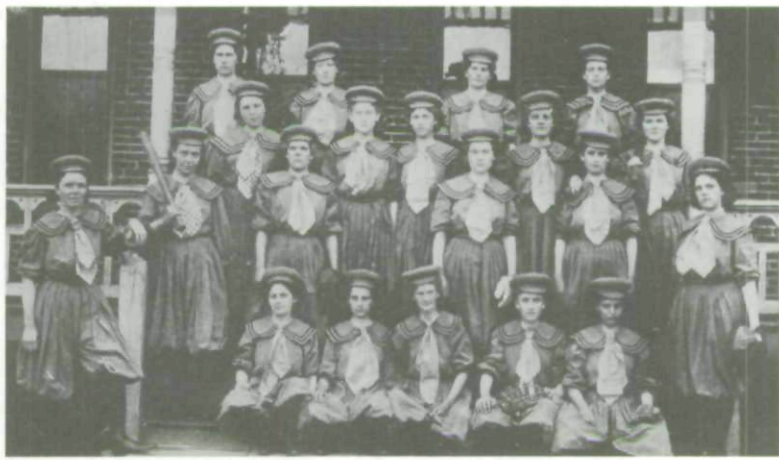
Girls baseball team of the Girls Reform School of Iowa.

mestic science training in the afternoon and vice versa. At the conclusion of the school day the girls went to their rooms to pray and to prepare for supper. The lightest meal of the day, supper usually consisted of baked fish, syrup, bread, and coffee. The girls spent their evenings occupied with daily homework assignments from the common school and other amusements approved by the staff, such as reading or participating in the literary society or Bible classes conducted by the girls themselves. 34