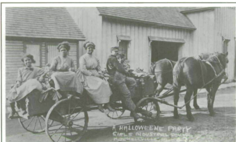
Four of the ninety black girls brought to the Girls Reform School of Iowa during the nineteenth century.

As their employment record indicates, most of the girls came from the rural state's few urban areas. Sixty-nine percent of the school's inmates came from counties with urban centers, even though in 1885, for example, counties with urban centers—towns and cities with a population of 2,500 or more—accounted for only 55 percent of Iowa's total population. Demographics best explain this phenomenon. Blacks and immigrants, who made up about half of the inmate population, tended to dwell in urban centers, where their concentration made them more noticeable to the native-born white population. 18