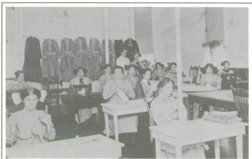
Sewing class, Girls Reform School of Iowa.

themselves when they leave the school." 31 Also, as family domestics, the girls were guaranteed a surrogate family life, which so many of them lacked. As domestics, they would also be living under the authority and supervision of employers who could, it was thought, continue to provide the influence and guidance the girls needed to advance in their reformation.