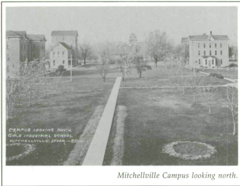
Mitchellville Campus looking north.

rived at the school, Lewelling placed her in one of two grades or classes according to academic ability. Group one went to the classroom following breakfast each weekday, while group two went to domestic science classes. Then after lunch the two groups exchanged places. 28