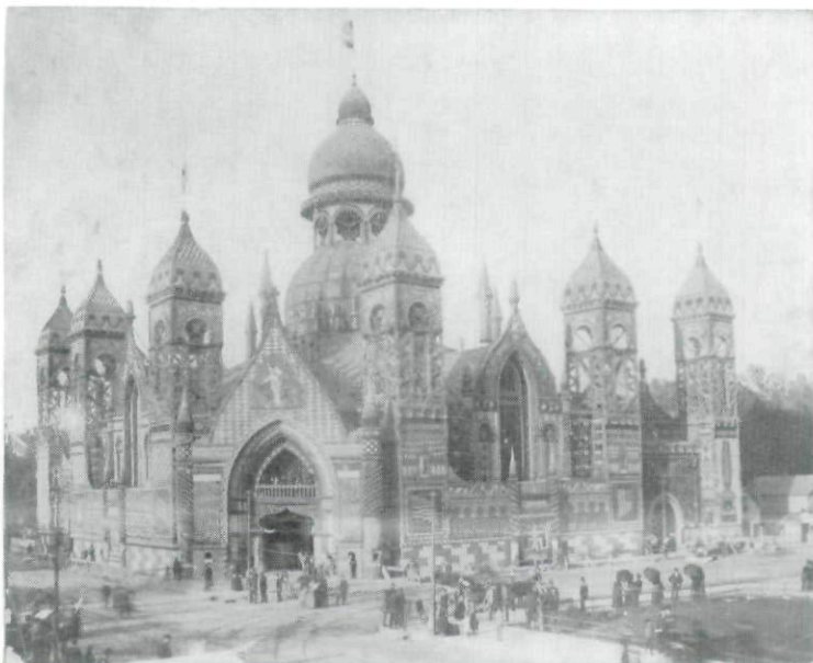
Fourth Corn Palace, 1890