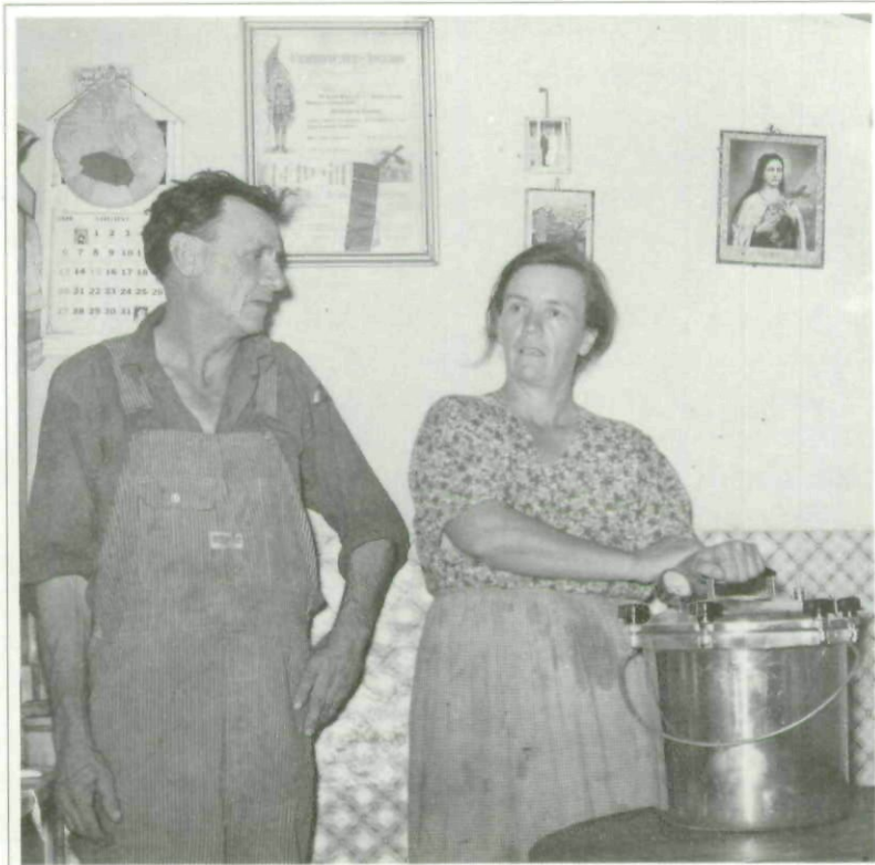
Fig. 3. Sheridan County, Kansas, August 1939.

accounts is oral history. A particularly useful oral history collection available in the Washington area is the Oral History of Southern Agriculture project held by the Division of Agriculture and Natural Resources at the Smithsonian Institution's National Museum of American History. This collection includes a significant number of transcribed interviews with white and nonwhite women who lived and worked in the rural South and whose descriptions of their experiences provide information that is unavailable in traditional written sources. The Division of Agriculture and Natural Resources also has on file information about numerous other oral history collections that include the testimony of rural women and are located in archives around the country. 11