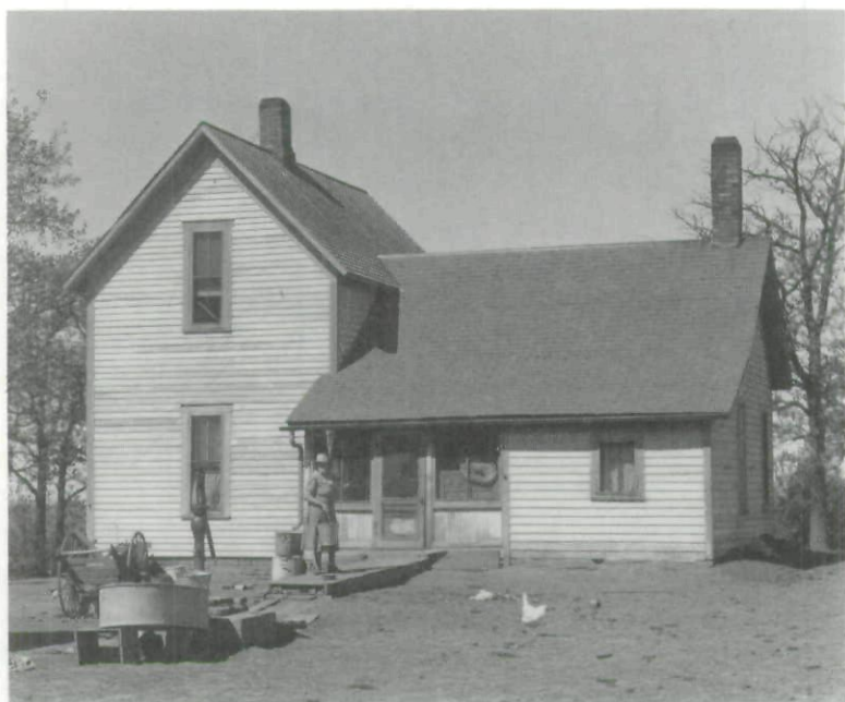
Fig. 1. Shelby County, Iowa, May 1941.

several pathbreaking studies, including a series of investigations designed to study the economic, cultural, and social stability of six rural communities across the United States. These six studies, each published in 1942 under the title Culture of a Contemporary Rural Community , were among the first works to offer significant discussions of rural gender roles; each of the studies gave women's activities considerable attention. 8 These classic works in rural sociology are available in government document libraries throughout the nation, but the original photographs made in conjunction with the series are only available through the Still Pictures Branch of the National Archives, housed in the archives' main building.