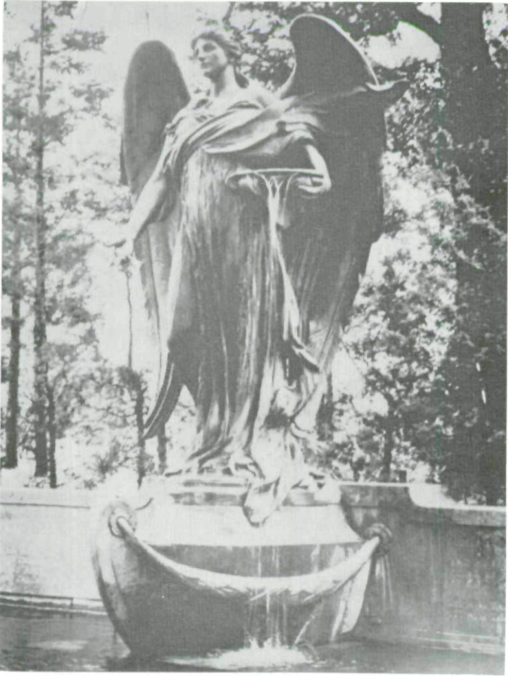
Department of History and Archives The "Black Angel" Statue

The third night Mrs. Dodge again experienced the dream, only that night she accepted the angel's request and drank from the cup of life. The next day she died. Before her death she related the dreams to her three daughters and in her memory they erected a large bronze angel. Over the years the bronze has blackened and today is appropriately referred to as the "Black Angel." The memorial is located adjacent to Fairview Cemetery.