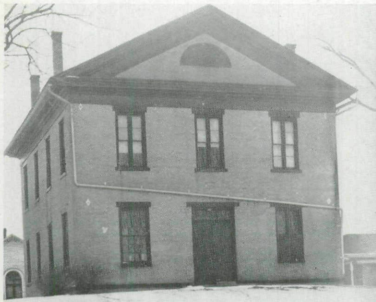
VAN BUREN COUNTY COURT HOUSE