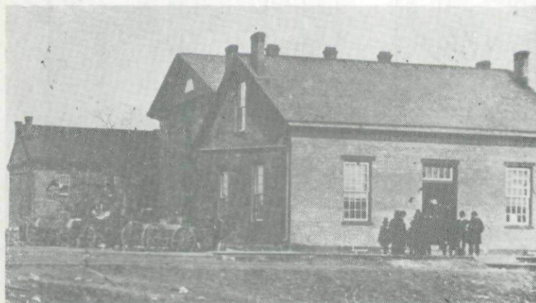
COURT HOUSE AND COUNTY BUILDINGS