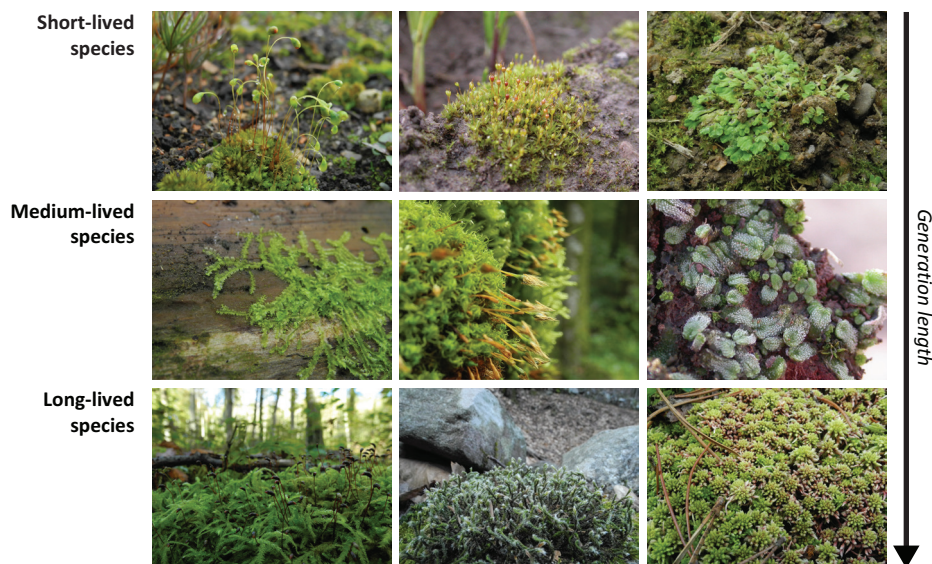
Figure 1. Examples of species with different generation lengths. Species from top left to down right: Funaria hygrometrica (fugitive), Tortula truncata (annual shuttle), Riccia glauca (annual shuttle), Lophocolea heterophylla (pioneer colonist), Ulota bruchii (short-lived shuttle), Exorotheca pustulosa (short-lived shuttle), Brachythecium rutabulum (perennial stayer), Hedwigia ciliata (long-lived shuttle), Sphagnum capillifolium (dominant).

The definitions of 'individual-equivalents' as outlined above closely follow the Red List Guidelines (IUCN SPSC 2017), but they are more precise and also more explicit than those originally suggested by Hallingbäck (2007). They are used in all cases where identification of 'mature individuals' is not possible. For the European Bryophyte Red List, each individual Red List assessment of a species