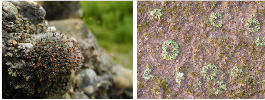
Figure 2. When species grow in discrete cushions such as Grimmia orbicularis (left) or as single rosettes ( Riccia spp., right), individuals rather than ‘individual-equivalents’ may be counted.

consistently specifies how the number of individuals was estimated when calculating population decline: 1) individuals in the strict IUCN sense, or 2) individual-equivalents as described above.