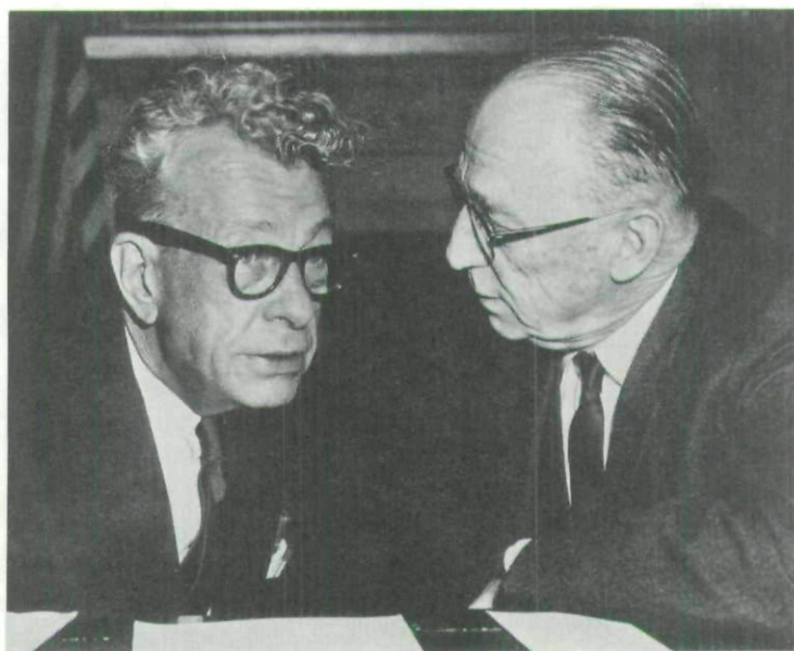
Senate colleagues Everett M. Dirksen and Bourke Hickenlooper, 1963.

area and have devastating adverse influence on the newly developing nation-states of Africa, the Middle East and Latin America. 39