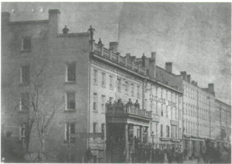
LeClaire Row, including the LeClaire House, looking east along the north side of Second Street between Main and Brady, c. 1862.