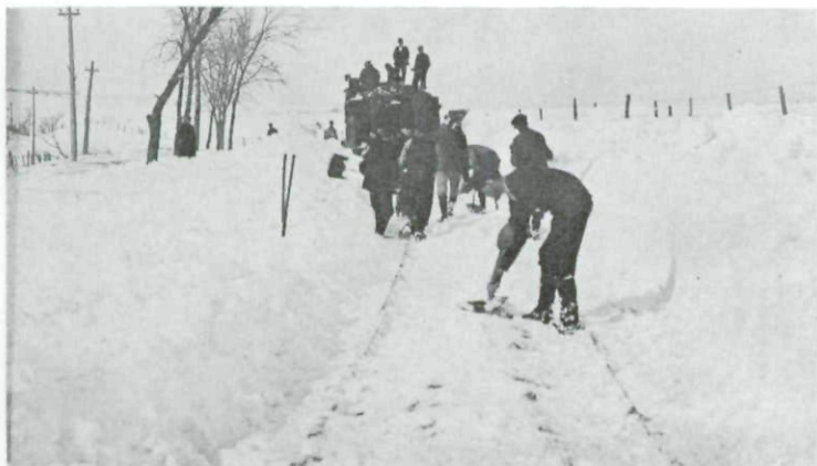
FARMERS ALONG THE ROUTE OF THE TABOR AND NORTHERN ASSIST IN DIGGING OUT THE SNOWBOUND TRAIN

The demand for passenger service began to decline even before the coming of the paved road. The ancient coach was abandoned in 1919, during my attendance at Tabor College Academy. The few passengers who patronized the line, including myself, were provided with boxes and barrels as seats in the freight car. A pot-bellied coal stove supplied heat in cold weather, after a fashion. Riding that little line that rolled and rocked through Mills County under such circumstances proved to be somewhat of a feat in gymnastics.