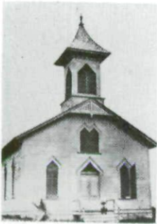
from Souvenir History of Colesburg Congregational Church, 1907

that reached the greatest number of people was a union meeting of three weeks held by "Billy" Sunday in 1899.