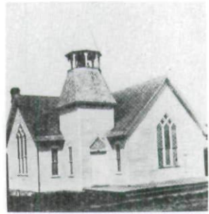
from Souvenir History of Colesburg Methodist Church, 1900

The first Methodist camp meeting in Delaware County was held in Colony in 1844. The meetings were held at quite regular intervals and were looked forward to and attended by people from miles around. The people came from their homes prepared to spend about two weeks. Some had tents, others covered wagons in which they slept. The cooking was done by a camp fire near by. The camp grounds were lighted in the evenings; a scaffold about five feet high was built around the grounds, about a foot of dirt was piled on top of the scaffold and fire placed on the dirt. Lanterns and candles furnished the additional light. The people who attended these meetings were happy people and their singing could be heard a mile away as they went to the camp grounds. The Methodists were especially noted for these revivals — the revival