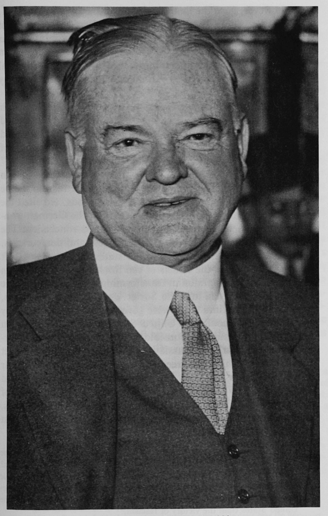
Hoover as he appeared in 1933