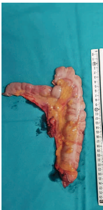
Figure 2. The intraoperative/surgical specimen