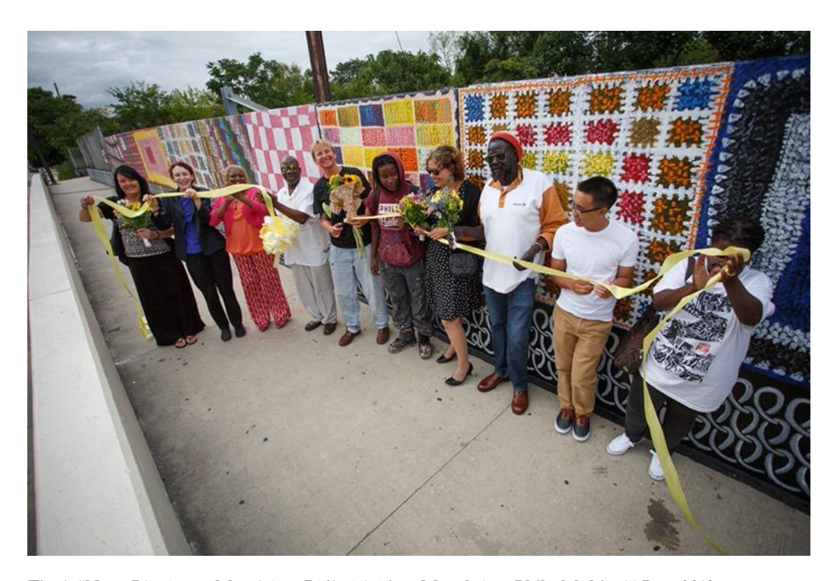
Fig. 1: "Nana Blankets – Mural Arts Philadelphia." Mural Arts Philadelphia , 14 Dec. 2018, <u>www.muralarts.org/artworks/nana-blankets</u>. Accessed 20 Jan. 2023.