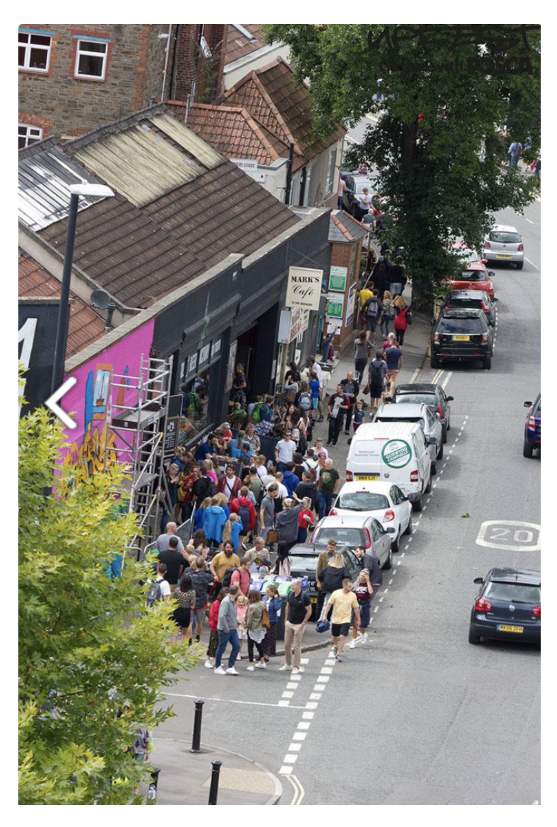
Fig. 4: "UPFEST 2018 | Upfest." Upfest , www.upfest.co.uk/photo-gallery/2018. Accessed 6 Sept. 2023. Photo credit: Kineta Hill

design. This engaged and even playful back and forth between residents and artists not only allows the community members to participate, but offers an opportunity for visual development to the artist by working with images and motifs that they cannot control in their usual way.