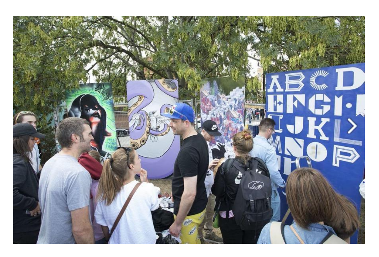
Fig. 5: "UPFEST 2018 | Upfest." Upfest , www.upfest.co.uk/photo-gallery/2018. Accessed 6 Sept. 2023.

Bristol Upfest is an ongoing street art festival in Bristol that brings big crowds to the city streets to watch artists paint as well as listen to music and party together. This photo shows the crowds around the artist Soker working in Bedminster at the 2018 event. Bristol is well-known for its rebellious vibe and the work and implications of the festival often reflect the old skool ethos of graffiti writers: "They think of graffiti as providing a counter-narrative, and serving as a counter-hegemonic form of self-expression that says both, 'I exist' and 'You do not want our graffiti here? Well, we do not want your wall, or building, or advertisement here and no one asked for our opinion when they were being put up'" (Mitman 183). Upfest began as a group of local artists and has ballooned over the years into a giant festival that goes far beyond its local roots, attracting artists and tourists from around the world.