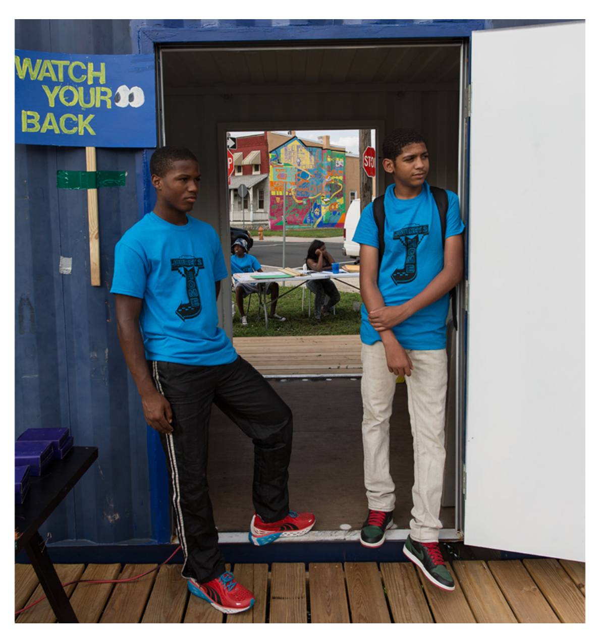
Fig. 2: "Journey2home." Journey2home, 10 Mar. 2013, journey2home.org. Accessed 20 Jan. 2023.

Ribbon cutting for the opening of the Nana Blankets mural in North Philly. This was a project of Mural Arts Philadelphia that collected its source material from community members directly. Neighborhood residents submitted images of handmade blankets and afghans that were cherished and made by family members. The textiles were painted on the Diamond St bridge in all their detail to remind passersby of their own blankets made by grandmothers, aunties, and mothers to give us a feeling of warmth, welcome, and love.