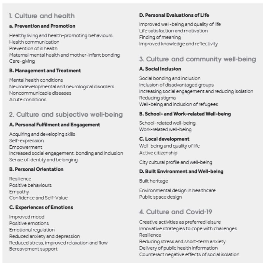
FIG. 1 – Culture-related Health and Well-being Outcomes

To give some examples, research suggests that music and singing can alleviate stress and anxiety, drama and storytelling can aid social interaction, photography and film can support self-expression, and the visual arts can promote the finding of meaning in one’s life. Moreover, regarding the specific issue of the potential contribution of arts and culture activities to community well-being, such activities can positively impact social relations, and citizens’ active engagement, among other issues. In particular, the scoping review also uncovers a link between people’s active participation in cultural activities and increased social inclusion and bonding. For example, research suggests that culture has the potential to support the health and well-being of vulnerable groups and