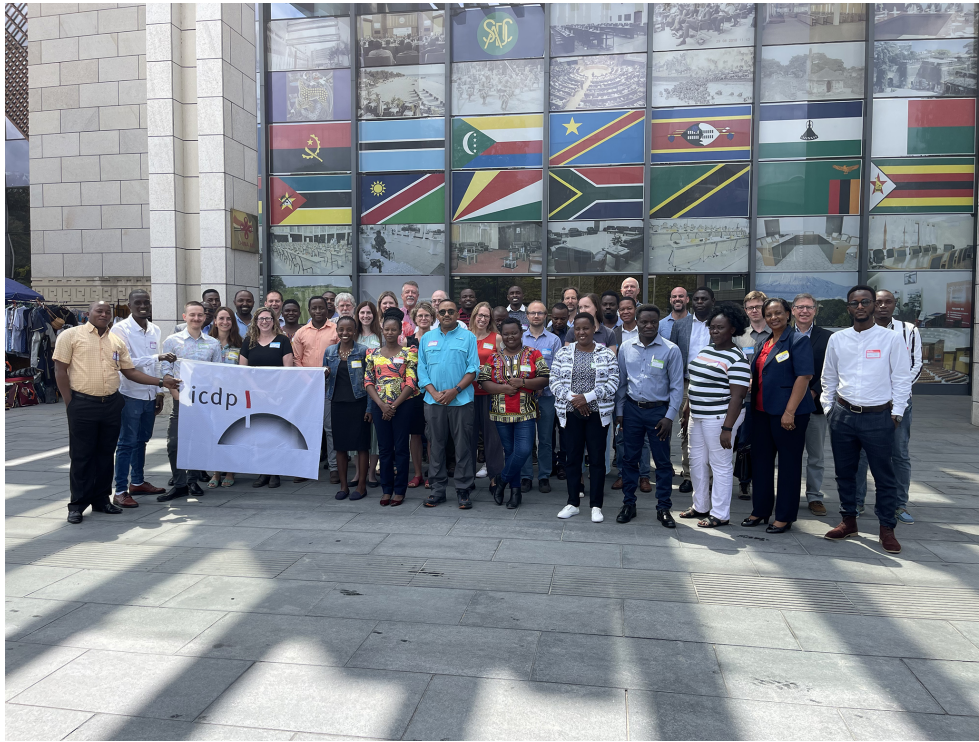
Figure 2. Group photo of LVDP workshop participants at the Julius Nyerere International Convention Centre in Dar es Salaam, Tanzania.

gional climate and evaporation and rainfall on Lake Victoria makes the lake highly sensitive to climate forcing factors such as insolation, SSTs, and atmospheric greenhouse gas levels. This in turn means that intervals when the lake is significantly different in size have profound effects on regional climate, which causes major, nonlinear, and abrupt increases and reductions in lake size (e.g., Beverly et al., 2020). Further, in contrast to the long, narrow, and deep rift lakes with large border faults forming half-grabens (Malawi (750 m), Tanganyika (1500 m), and Turkana (110 m)), Lake Victoria's shallow depth ( \sim 70 m) and large surface area likely result in very different catchment processes (e.g., Beverly et al., 2020) and responses to climate change than the large and deep rift lakes.