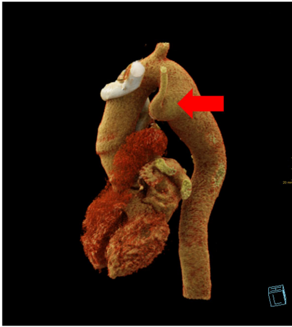
Figure 1: A computer tomography scan reconstruction of aberrant left subclavian artery with Kommerell's diverticulum marked with a red arrow.