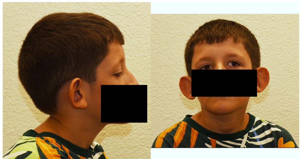
Figure 1. Facial images of the described patient at the age of 12 years. The side view ( left panel ) shows the low-set protruding ears. The front view ( right panel ) shows the broad and low root of the nose, the sloping eyelid axis and ocular torticollis.

The mother, then aged 22 years, gave birth after an uncomplicated pregnancy with vaginal delivery at term. The boy had a birth weight of 2540 g (1–2th centile), a head circumference of 32 cm (<1th centile) and a birth length of 47 cm (1–2th centile). Apgar score was 8, 9 and 10 at 1, 5 and 10 min respectively. He was born with a bilateral syndactyly of toes II/III and facial dysmorphism including a flat midface, broad and low nasal root, narrow lips, low-set protruding ears and downslanting palpebral fissures. After birth, the first clinical concerns were episodes of cyanosis during feeding and the inability to drink due to hypotension of the oropharyngeal muscles. Later, a muscular hypotension of shoulder and torso muscles was diagnosed and resulted in delayed motor development (sitting without support at 11 months, walking alone at 22 months) and difficulties in coordination and fine motor skills. Further assessments revealed delayed cognitive skills and a development quotient of 64 to 86 over time. Speech progression was normal under speech therapy. Hearing assessment and brain MRI were normal.