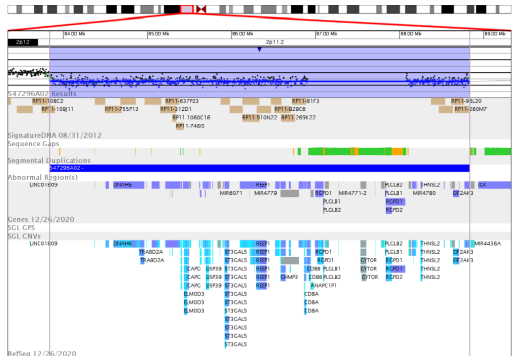
Figure 3. Array CGH analysis showing the heterozygous interstitial microdeletion \text{arr}[\text{hg}18]2\text{p}11.2(83,836,581\_88,835,028)\times 1 in detail. The 2p11.2 chromosomal region (top row, red box) is enlarged to show in detail (from top to down): probe array signals (black dots) with heterozygously deleted region (shaded in blue); sequence gaps (green, orange); deleted genes and loci (gray, blue, light blue).

This region harbors 46 protein-coding genes, three pseudogenes, eight microRNAs, five other RNAs (nucleolar, non-coding, anti-sense) and five undescribed loci (Table 2).