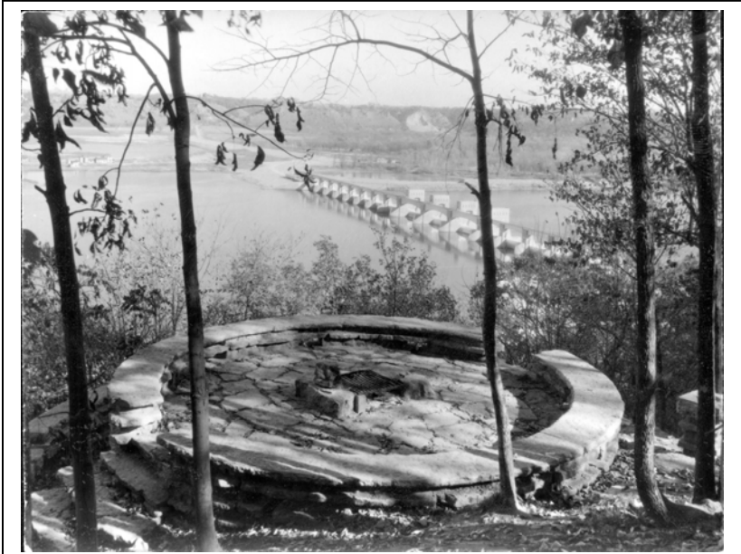
Eagle Point Park offers panoramic views of the Mississippi River and the tri-state area.

higher learning, including Loras and Clarke colleges, the University of Dubuque, and Wartburg and St. Bernard seminaries. For the majority who did not pursue higher education, working at “the Pack,” “Deere’s,” or other unionized shops was the zenith of blue-collar employment, providing wages that lifted thousands into a middle-class standard of living.