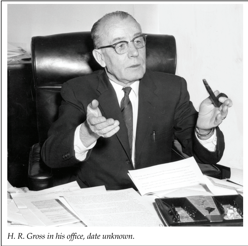
H. R. Gross in his office, date unknown.

amount of deliberation, and his contribution to the quality of deliberation matched his contribution to the quantity of deliberation. One author noted that Gross “is generally well prepared, he is a good debater . . . and his questions are germane.” Longtime Georgia Representative Carl Vinson once remarked, “There is really no good debate unless the gentleman from Iowa is in it.” Some House observers have raised serious questions about the general quality of congressional deliberation—suggesting that it is not a priority for many members. Gross, however, dedicated his congressional career to raising the standard of deliberation in the chamber. Furthermore, Gross’s attentions seem to have ensured a closer fidelity to rules and other official standards of operation. Republican James Utt of California once stated that other members of the House “have come to rely on