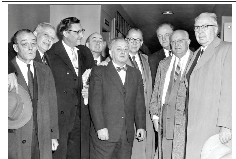
The Iowa congressional delegation (with Gross on the left) posed with Secretary of Agriculture Ezra Taft Benson on the day President Eisenhower delivered his farm message to Congress. Gross was not pleased.

farm program, and of the president himself for retaining Secretary of Agriculture Ezra Taft Benson in the face of Republican congressional criticism. When Eisenhower responded that “those who head the various executive departments, once having been appointed, are no longer the concern of Congress,” Gross accused the president of “treading dangerously close to autocratic rule.” 19