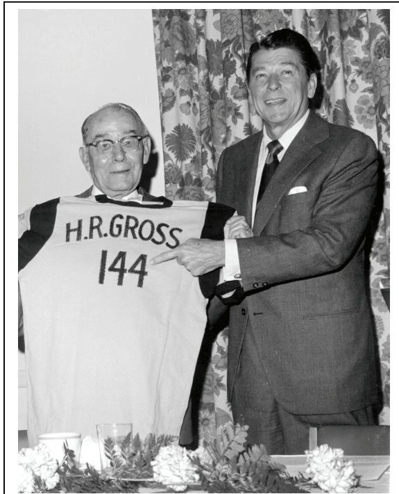
At a meeting of the Bull Elephant Club in 1974, former broadcasting colleague and then Governor of California Ronald Reagan presented Gross with a shirt bearing the logo "H.R. Gross 144."

eral program of fiscal restraint. More fundamentally, House Republicans were the minority party for almost all of Gross's tenure. During his 13 terms, Republicans controlled the chamber only from 1952 to 1954. That impeded Gross's ability to sponsor or back successful legislation. Finally, Gross was truly a singular voice. Indeed, he appeared to revel in such a status; one author noted that Gross seemed to cultivate the image of a loner by choice. The status of an isolated, rank and file, minority party member is not a recipe for influence in the U.S. House of Representatives. 57