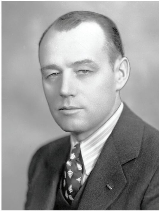
This portrait of H. R. Gross appeared in the Des Moines Register in 1940, at the time the paper reported that Gross had filed to run for the Republican nomination for governor.

he would later show in Congress: a fierce independence and a contrary – even conflictual – relationship with his own party.