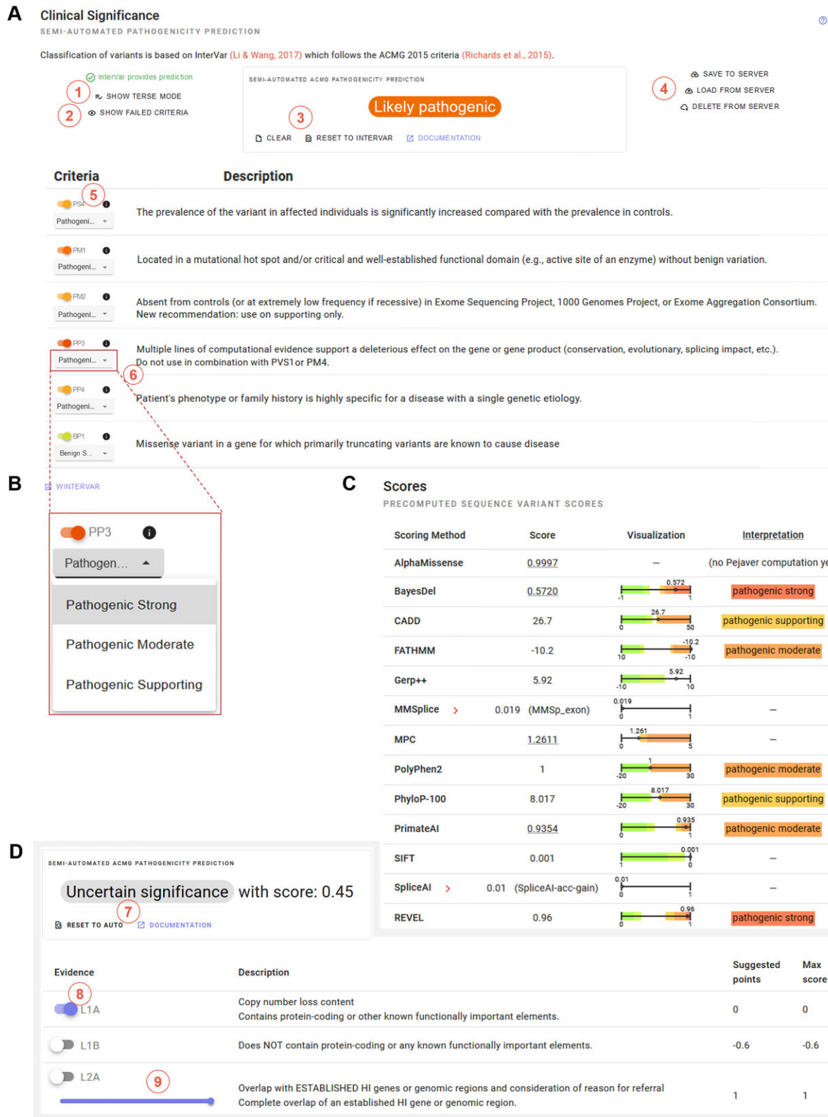
Figure 1. Semi-automated ACMG Classification. Overview of semi-automated variant classification using REEV. (A–C) ACMG classification of a sequence variant. (A) Semi-automated classification based on the InterVar tool. The user can (de)activate a terse mode (1), show or hide failed ACMG criteria (2) and clear or reset chosen criteria to auto (3) meaning they are computed rather than user set. Logged in users can also load and save the classification of variants (4). Every criterion can be (de)selected manually (5) and set at the chosen level of confidence (6). (B) Example of this manual setting of the level of confidence for the variable pathogenicity prediction criterion PP3. (C) Overview of variant pathogenicity scores from different tools (aggregated by dbNSFP) as well as color coding and calibrated scores where applicable for an easy and correct usage of the modified PP3 criterion following Pejaver et al. (46). (D) Semi-automated ACMG classification of a structural variant based on AutoCNV (applicable for ACMG/ClinGen CNV criteria 1–3 of 5 (17)), which can also be reset (7), (de)selected manually (8) and set at the chosen level of confidence (9).