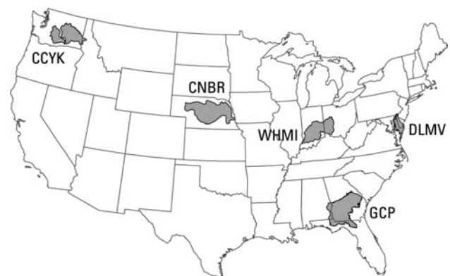
Fig. 1 Location of the five agriculturally dominated study areas

Sites were selected within each study area to maximize the potential range of nutrient concentrations while minimizing other natural or anthropogenic factors. Sites were not selected in order to extrapolate to the population of streams in the region. Basin-level coverages within a study area