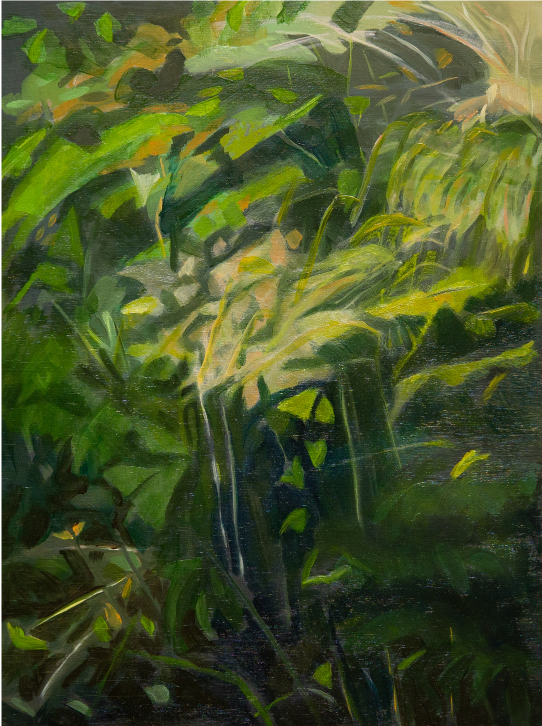
Prairie Pines Puddle , 2024 Oil on panel 12" x 12"