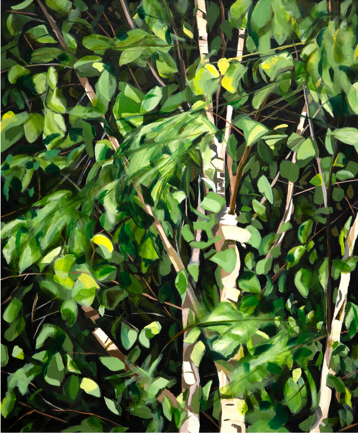
Tom Lake, 2023 Oil on canvas 55" x 63"