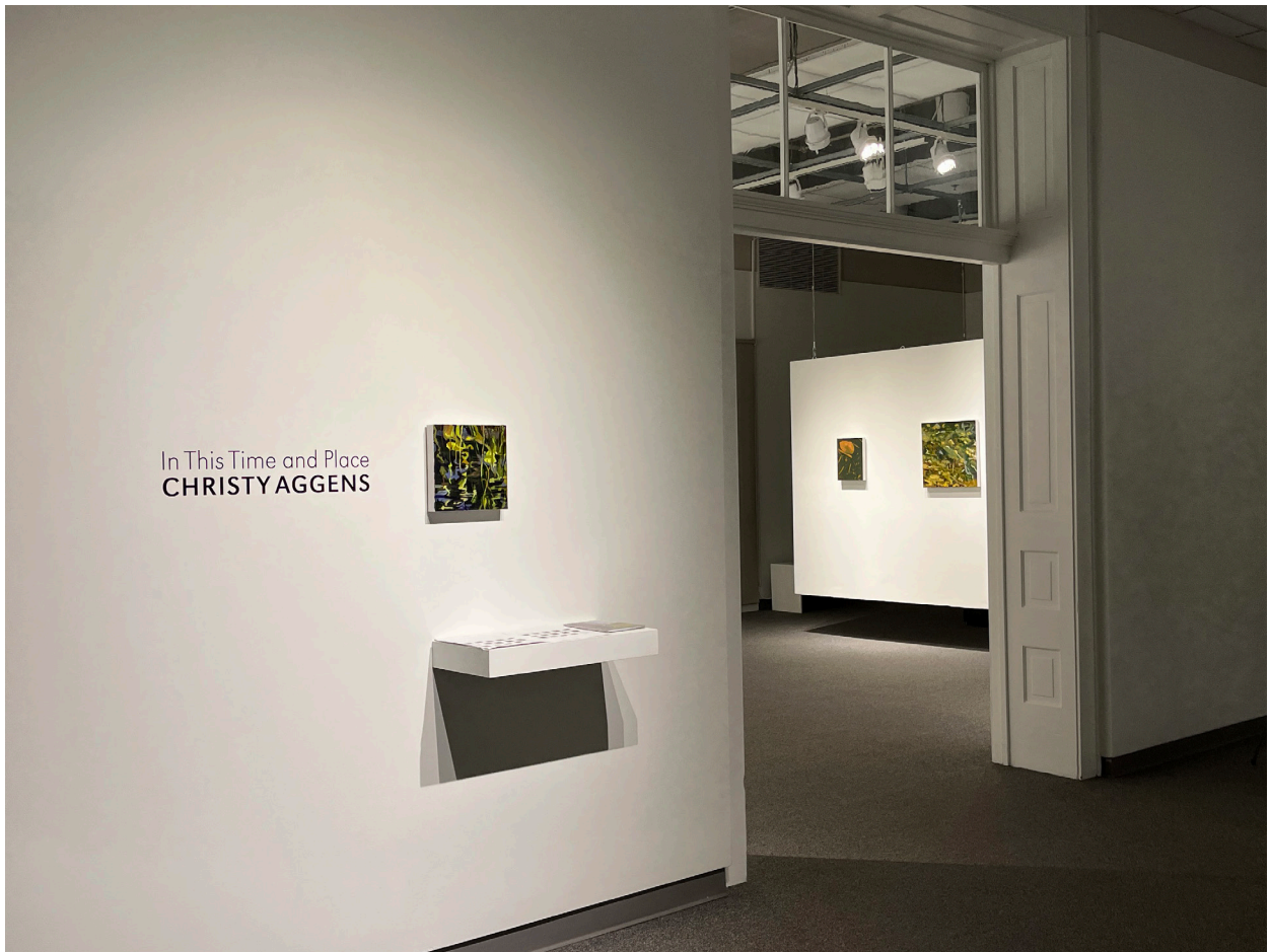
In This Time and Place Marth 18-22, 2024 Eisentrager Howard Gallery Lincoln, NE