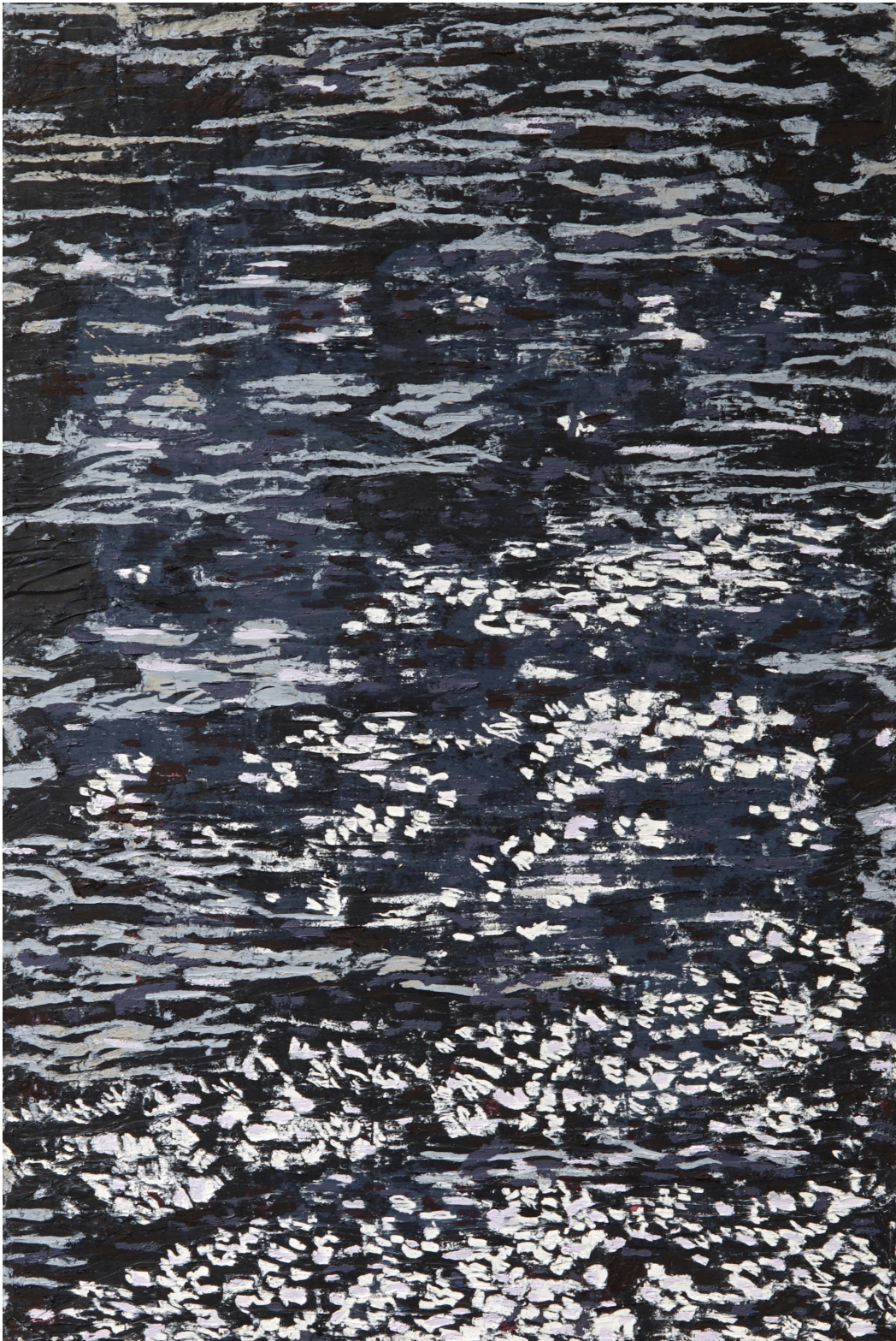
Other Man Lake, 2024 Oil on canvas 18" x 12"