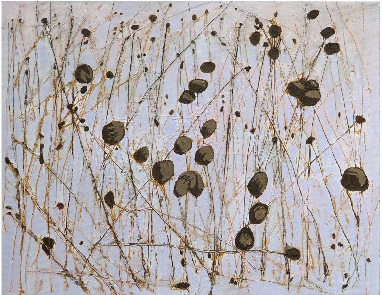
Pioneers Park Seed-heads, 2024