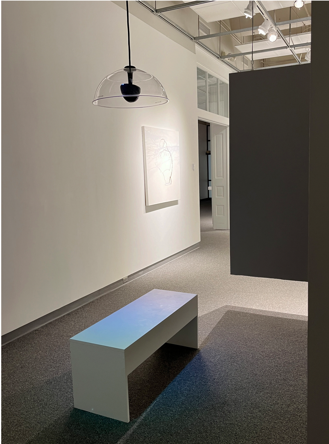
Jack Sinn Memorial SWMA, 2023