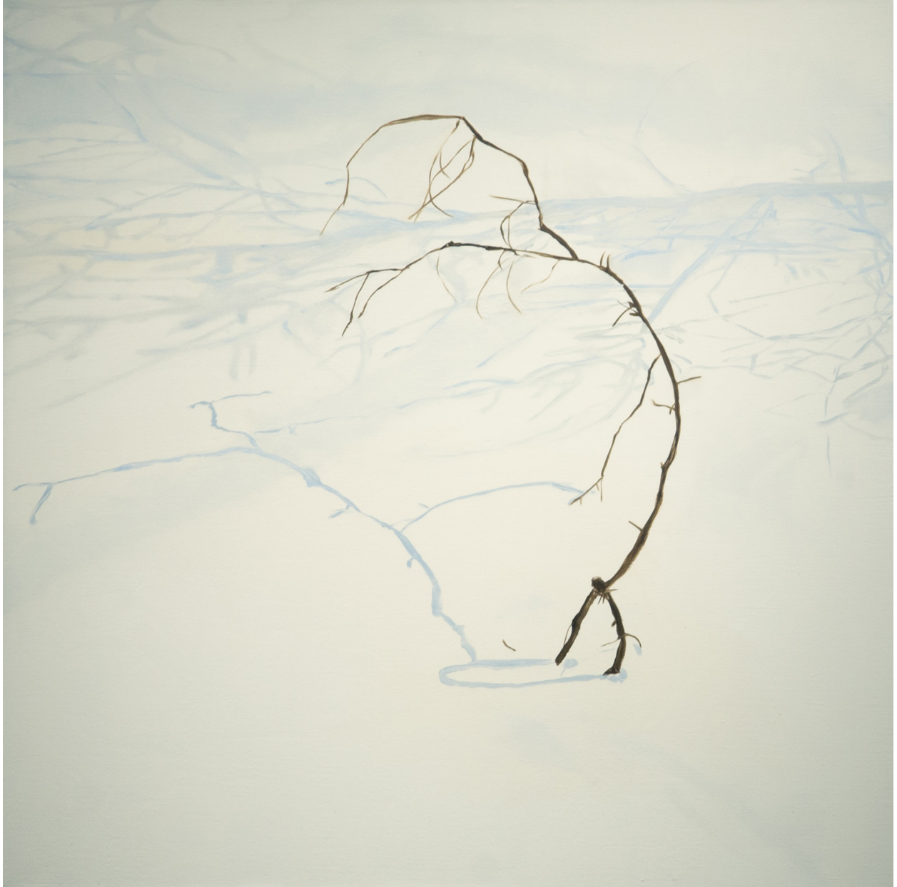
Pioneers Park Shadow , 2021 Oil on canvas 43" x 43"