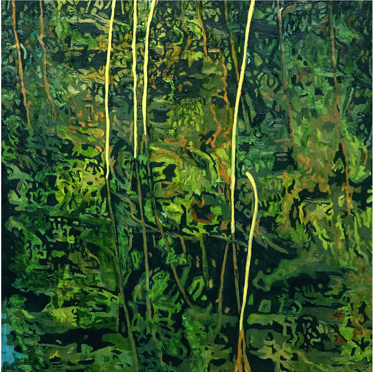
Tom Lake #2, 2023 Oil on panel 18" x 18"