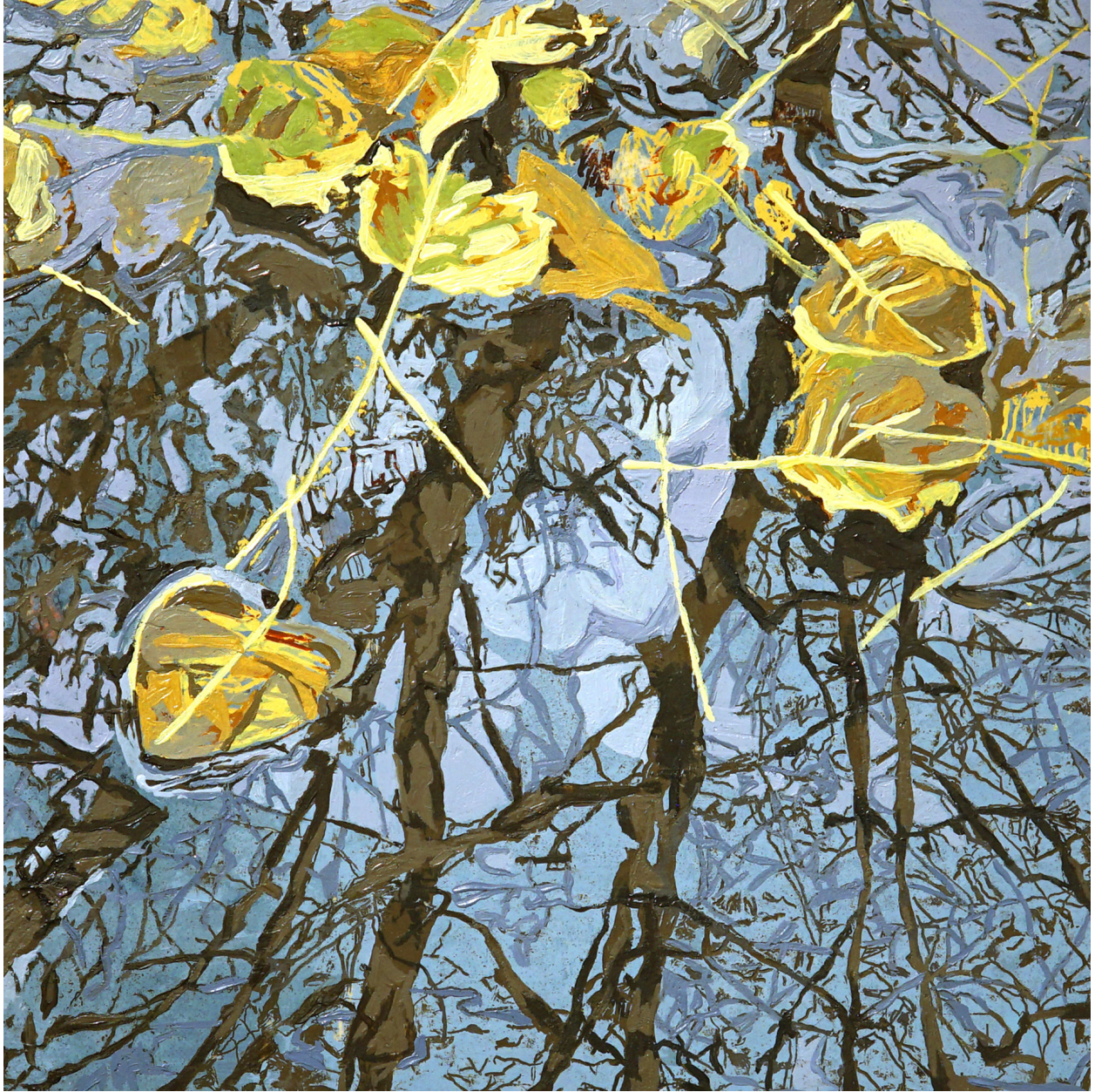
Prairie Pines Puddle , 2024 Oil on panel 12" x 12"