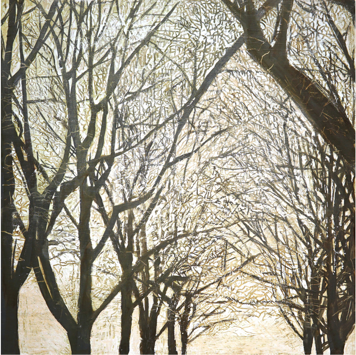
Harwood Street, 2023 Oil on panel 18" x 18"