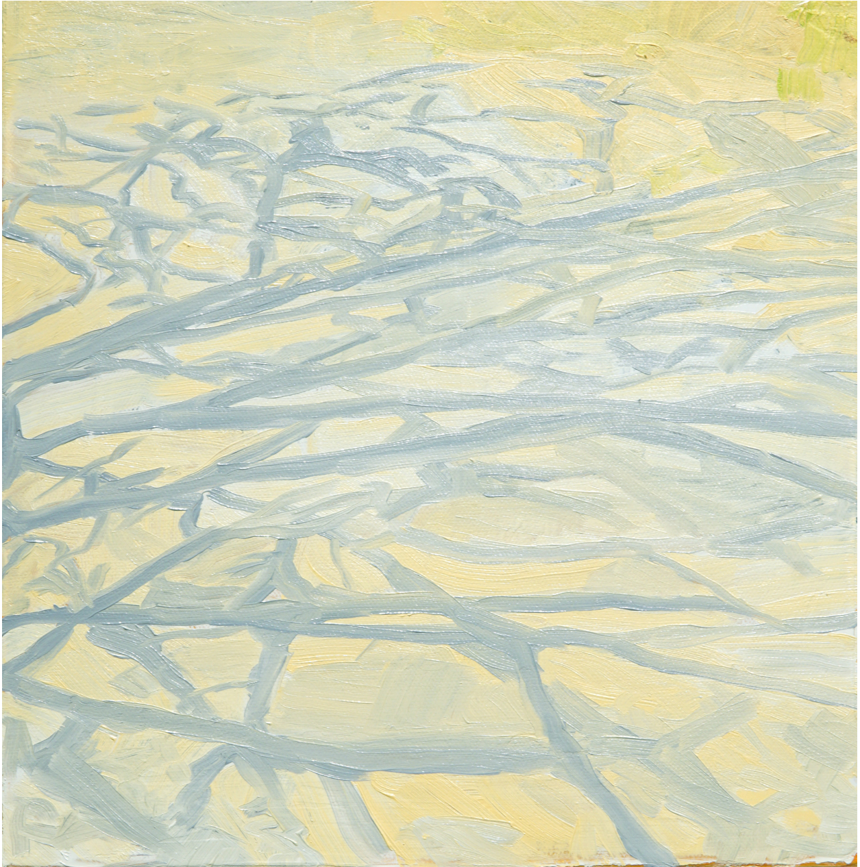
Prairie Pines Shadow , 2023 Oil on canvas 12" x 12"