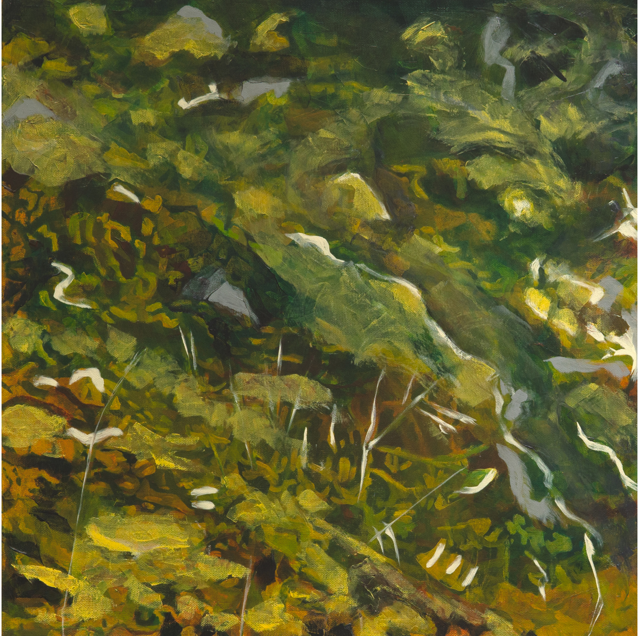
Tom Lake #6, 2024 Oil on canvas 20" x 20"