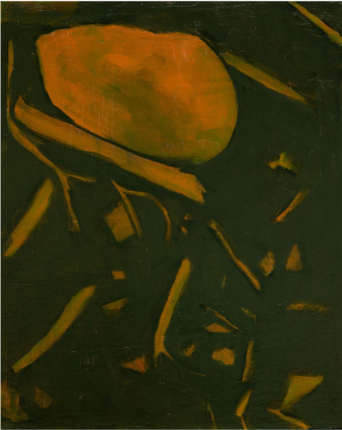
Tom Lake #5, 2023 Oil on canvas 14" x 11"