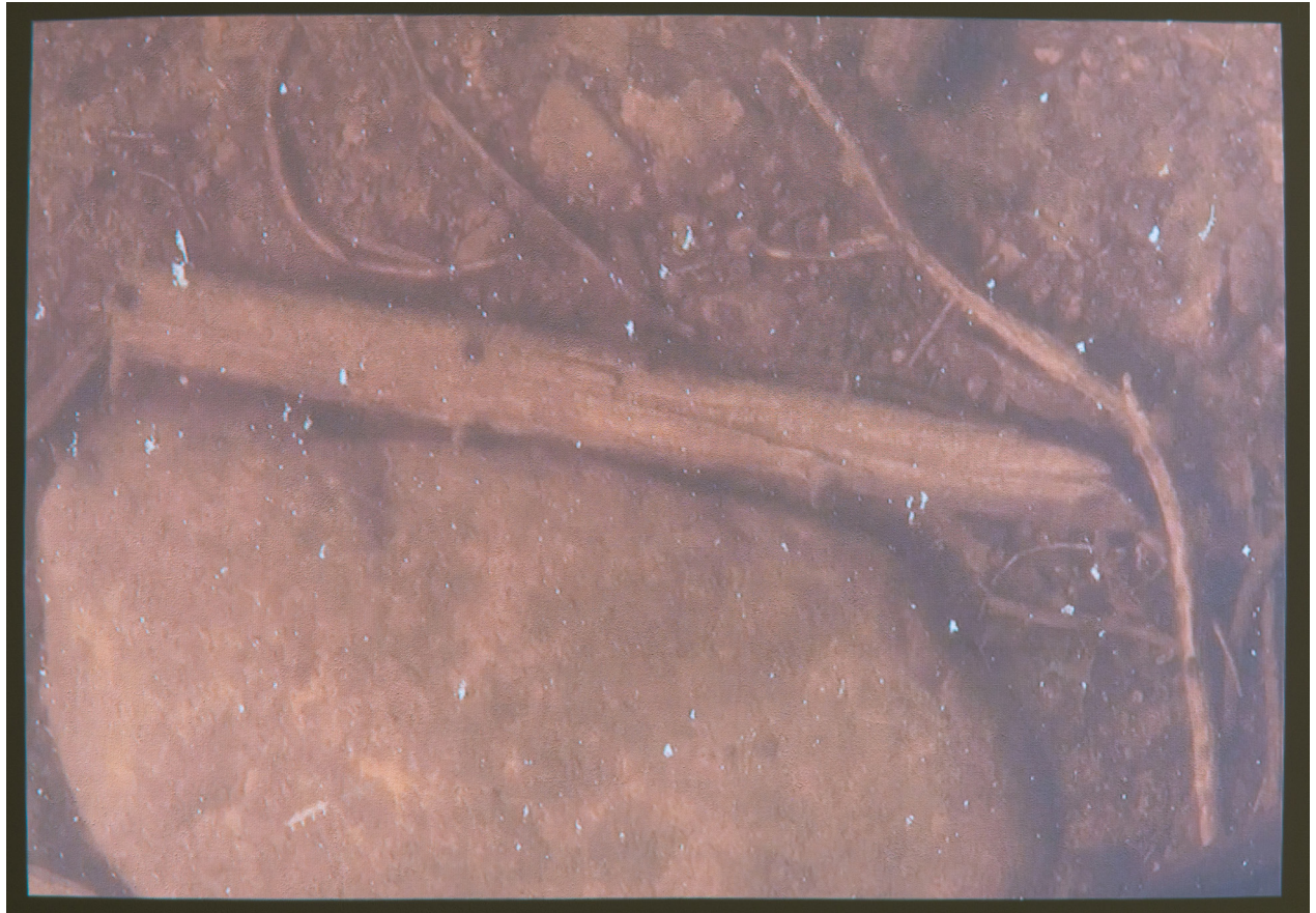
Tom Lake #4, 2022 Video Projection 29" x 39" 15:18 minutes