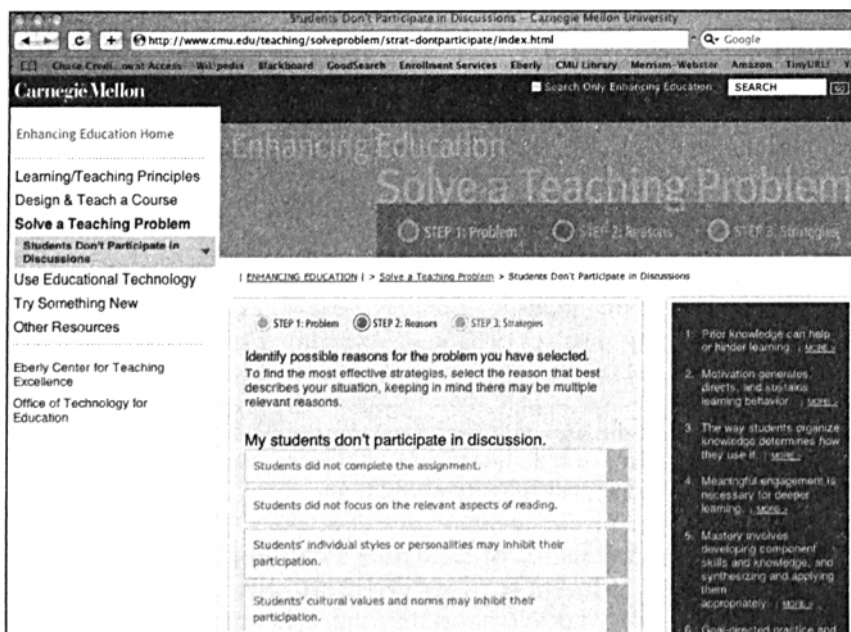
Figure 10.4. Screenshot of One Problem and Possible Reasons (page scrolls down)

in case the user wants to learn more about learning theory in relation to her specific problem. Every subpage contains a text box at the bottom, inviting the user to contact the center if she wishes to know more or to tailor the consultation to her specific context. An important feature of the site is that the steps are sequential. Thanks to the link structure of the Web pages, one cannot jump to the strategy pages without exploring possible reasons first.