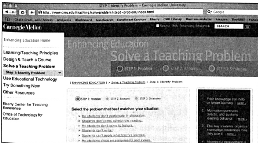
Figure 10.3. Screenshot of Teaching Problems and Learning Principles (page scrolls down)

teaching strategies addressing that reason are offered. Some of the strategies link to relevant pages on the center's Web site (for example, designing and using rubrics, classroom assessment techniques). On this page's sidebars, the principles most pertinent to the reason are highlighted. The principles are also clickable,