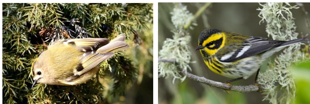
Figure 5. Examples of declining songbirds that require mature temperate and boreal forests to nest include the Goldcrest ( Regulus regulus ; left), which has declined by 49% since 1980 in Europe [64], and Townsend's Warbler ( Setophaga townsendi ; right), which has declined by 15% since 1970 in North America [66].