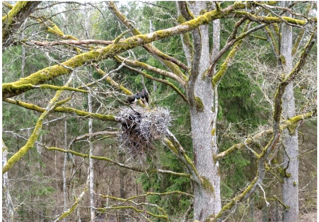
Figure 2. A migratory bird that depends on large, mature trees for nesting in Europe, the Black Stork ( Ciconia nigra ) has been extirpated from Scandinavia and is now critically endangered in Latvia [79].