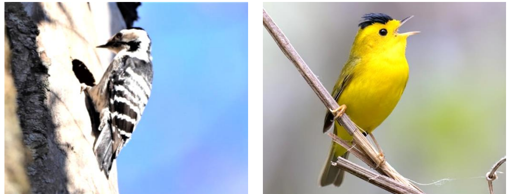
Figure 1. A European resident that is negatively affected by logging operations, the Lesser Spotted Woodpecker ( Dryobates minor ; left) has declined by 80% in boreal forests since 1980 [64]. An American migratory species that is negatively affected by logging operations, Wilson's Warbler ( Cardellina pusilla ; right) has declined by 57% in boreal forests since 1970 [66]. Lesser Spotted Woodpecker photo by Nico Arcilla; Wilson's Warbler photo by Dan Marks.

Grouse ( Tetrastes bonasia ), Eurasian Three-toed Woodpecker ( Picoides tridactylus ), Lesser Spotted Woodpecker ( Dryobates minor ; Figure 1), Pine Grosbeak ( Pinicola enucleator ), Siberian Jay ( Perisoreus infaustus ), Siberian Tit ( Parus cinctus ), and Willow Tit ( Poecile montanus ), which have declined significantly since 1980 [7,64,71–74]. American migratory species that are negatively affected by logging include the Eastern Whip-poor-will ( Antrastomus vociferus ), Bicknell's Thrush ( Catharus bicknelli ), Cerulean Warbler ( Setophaga cerulea -72%), Canada Warbler ( Cardellina canadensis -62%) Wilson's Warbler ( Cardellina pusilla -57%), Blackpoll Warbler ( Setophaga striata -92%), and Purple Finch ( Haemorhous purpureus -47%), which have declined between 47–92% since 1970 [66,69,71,75].