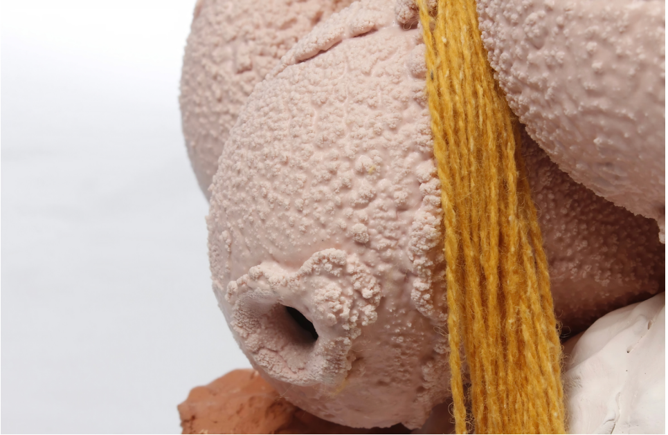
Glazed ceramics, mixed media, and photography (2024)