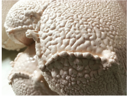
Glazed ceramics and photography (2024)