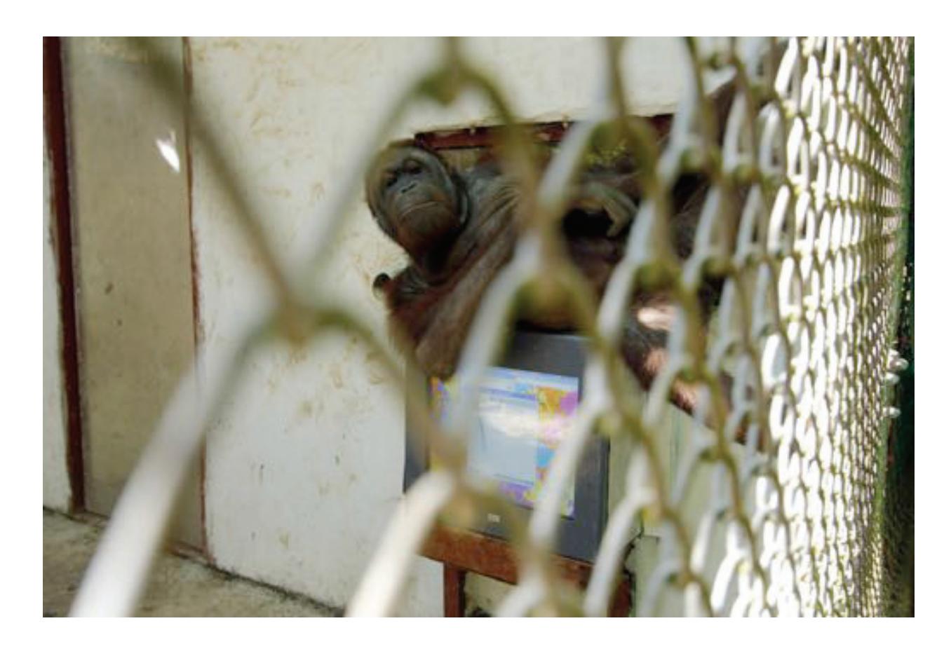
Figure 3: Bento 'owns' the screen. 23 July 2011

continue pursuing the apes' use of touch screens, however, I should mention various encouraging uses of the screen, too. Sitting down with them and observing their play behind a glass hours after hours, I have surely witnessed genuine interest in exploring items on the screen, watching videos of humans and orangutans, and exploring how different interfaces work. At this stage, the apes seem to have understood a difference between moving live footage and graphic elements. These may be assumedly learned from my and other humans' use of the same screens. The apes have learned not to touch moving image, whereas graphical elements and thumbnail photos gain their interactive inspection.