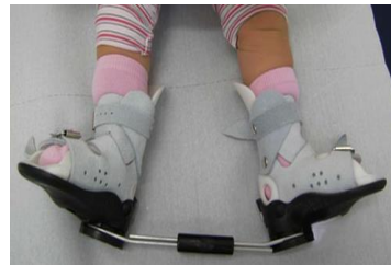
Figure 5. Foot abduction orthosis- Dennis Brown bar.

ankle equinus, and forefoot adduction. Manipulation is performed by using pressure over the calcaneo-cuboid joint followed by toe to groin casting for every seven to ten days until full correction. The next step is to wear the full time splint with heel lock to avoid the varus, and medial bar used to avoid the adduction. Patients may only require the splint at night if they are able to walk. Special footwear is typically required until the age of 4 to 5 years. The footwear should have the Thomas reverse heel, open toe box, lateral flaring of the sole, and straight medial border (Kite,1939; Changulani et al. 2006). Some of the clubfoot shoes are shown in the following figure.6