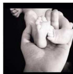
Figure 1. Unilateral clubfoot (2weeks baby)

1995). Children with untreated or neglected clubfoot experience severe limitation in wearing normal footwear and mobility. In addition, walking with the dorsal side of the neglected or untreated clubfoot will create other complications such as callus formation, skin injuries and infection of the foot (Dobbs & Gurnett, 2009).