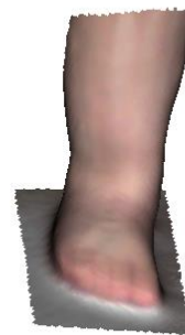
Figure 9. Right side 3D Clubfoot

These scanned 3D images were stored into the computer and processed by the help of Artec Studio 9. After the process of images by the help of Artec studio 9 software, the results of 3D clubfoot model as shown in figure 8.