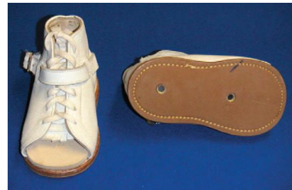
Open toes straight shoes