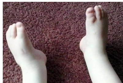
Figure 2. Bilateral clubfoot -2 years old child