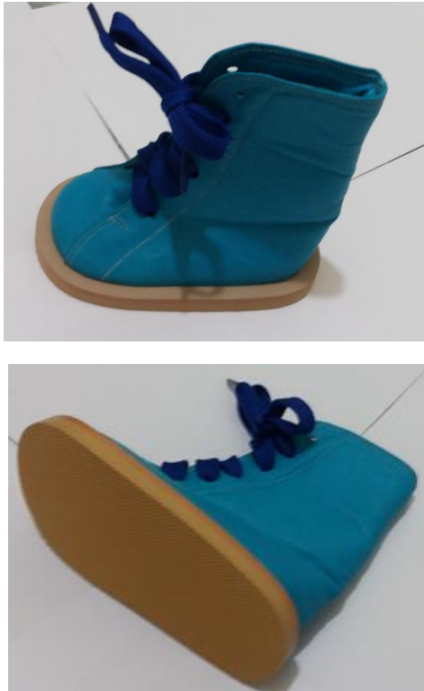
Figure 10. Newly designed clubfoot footwear

deformity (Figure 10). The features are: increased thickness of outsole up to the level of ankle joint, moderate level of thickness of insole. Outsole thickness of footwear is increased up to the level of ankle joint to control the foot in the normal position. Heal counter developed with firm thickness and height increased above the level of ankle joint to maintain the stability and keep the ankle joint in a normal alignment position.