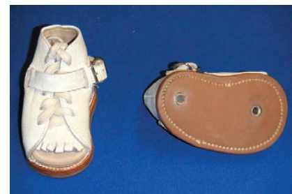
Open toes abducted last shoes