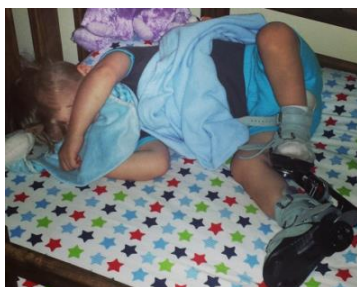
Figure 4. Boots and bar at night time

Generally, there are two conservative methods (The Ponseti method and the Kite method) that use footwear and the features of footwear described. Once the foot is fully corrected by the Ponseti method, the Dennis Brown splint with open toe tarso-pronator footwear is recommended; the splint should set the foot at a 70 degree external rotation to maintain the correction. If the child is affected by unilateral clubfoot, the unaffected side of the foot needs to be kept in a 30 to 45 degree external rotation to maintain the abduction of forefoot and calcaneus, and to stretch the medial side of the soft tissue. At the beginning, the child needs to wear the splint 24 hours a day, then only at night time with the open toe box, Thomas reverse heel, straight medial border and lateral flaring of the sole until age of four to 5 years (Kite, 1972).