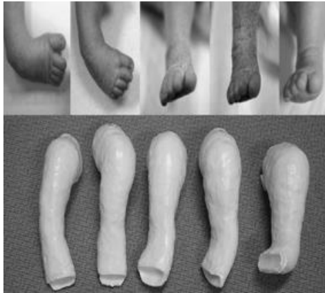
Figure 3. Serial casting method in a various weeks (Bergerault& Fournier, 2012)

Ponseti method, manipulation, casting, Achilles tendon tenotomy, and a foot abduction brace, have been used to correct the deformity. The Ponseti method alleviates the stiffness and pain, avoids the surgical procedure and avoids overcorrection (Laaveg& Ponseti,1980).