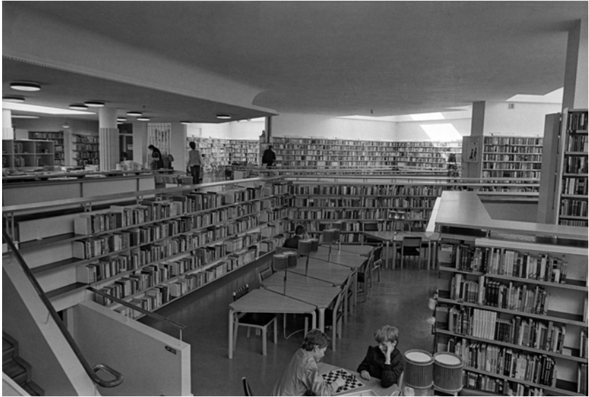
Figure 2. The Rovaniemi City Library, built in 1965, was designed by Alvar Aalto. The typical features of Aalto's libraries include the sunken areas for reading, and the ingenious use of indirect natural light. The interior of the Rovaniemi City Library is an imposing architectural synthesis and a personal interpretation of the program of the modern public library.

in Finland, not only to offer the much needed extra light, but also to enliven the general ambience of many library interiors, or to highlight certain chosen areas for functional or aesthetic reasons. In Aalto libraries the ample, indirect natural light from skylights compensates for the overall "closeness" of the exterior walls and the lack of views to the outside. Such introspectiveness has determined to some extent the ambience of the interiors of many later Finnish public libraries.