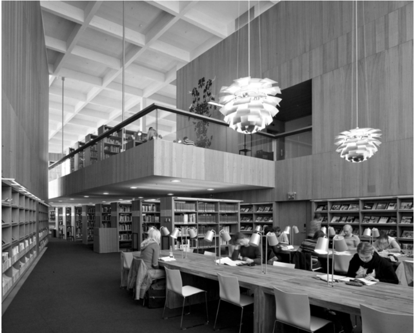
Figure 5. The new extension to the Turku City Library, built in 2007, a splendid example of the possibilities for expanding existing public libraries. The library consists of new and old parts, creating a historically multilayered public space.

These situational and contextual prerequisites produced architectural solutions that not only emphasized the differentiation and detachment of the new and old parts of the library, but also paid little attention to the overall urban milieu. Even the old wooden building on the site was doomed to demolition by the official rules of the competition.