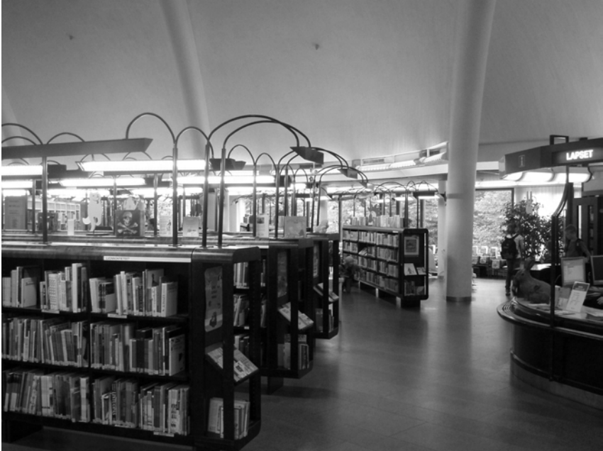
Figure 4. The Tampere City Library, built in 1986, is one of the most iconic library buildings in Finland in recent decades. It has played a decisive role in promoting the idea that the architectural character of the public library should proclaim the cultural position of the institution in society.

The renovation of existing libraries and the conversion of other buildings have gradually become more important, although are somewhat rare in Finland. 30 In contrast to the 1950s, this has not been primarily due to economic necessity, but to other reasons, with the underlying cultural and historical values significant in such projects. The Turku City Library is also a good example of how unpredictable the building process of a public library can be. It can take years to build a public library in Finland. Local, political consensus on the matter must be first reached, which may take a long time, and even after that, fluctuating economic situations may prolong the matter seemingly indefinitely.