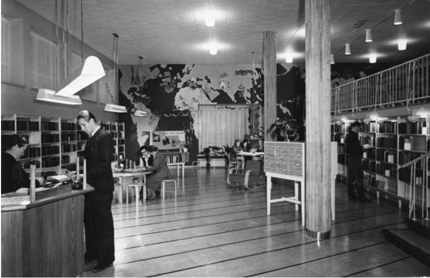
Figure 1. The Lauritsala Public Library, built in 1951, was a milestone in Finnish postwar library architecture. The understated, considered architecture showed the way toward a more optimistic future.

war—the town of Rovaniemi was razed to the ground by the retreating German troops in 1944—and at a more concrete level as an act of novel active regional policy, a cornerstone of the Finnish welfare state project.