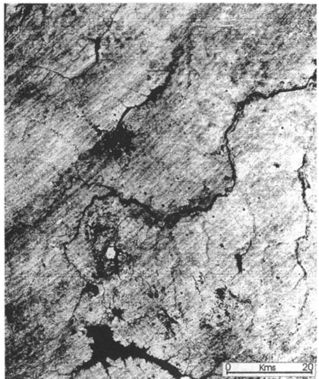
Figure 1. LANDSAT Thematic Mapper thermal image, Path 188, Row 52, of 12.19.86, showing thermal strips in the region surrounding Kano City (darker-toned area in upper left centre). Wind direction at the image time is north-easterly (40°), wind speed is 6.3 m/sec. An evident curve to the right (of 15° per 100 kilometers) corresponds to the Coriolis effect.

Ground truth observations were carried out over an 8-week period in the mid-dry season of 1997 to test the possibility of the thermal strips being caused by the differential flow and heating of sand grains above ground level giving hot white lines. This involved the placement of six 0.5 X 0.5 X 0.5m. box traps open to the prevailing wind direction at ground level, with wet collection trays inset to the ground. The placing corresponded to alternating light and dark strips on the images. Surface temperature was recorded using contact thermistors and a heat spy radiometer, and wind data collected. No significant differences in particle