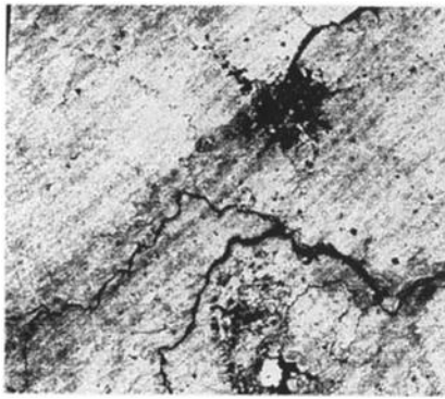
Figure 2. Extract of Figure 1 showing wider thermal strips in the lee of Kano City.

entrainment or deposition near the ground, or in temperature or wind characteristics at the scale of the striations were observed. The amounts of sand collected, and mean wind speeds, were much lower than the 5m/sec. normally associated with active sand movement associated with dune formation. Subsequent to the fieldwork, the second mid-dry season image, of 17 th January, 1986 was obtained, showing the thermal striations to have a slightly different position, wavelength and orientation for the two dates.