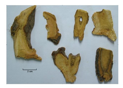
FIGURE 1: Photo of the dried root of Polygonum cuspidatum (Hu Zhang).

Zhang is used to remove jaundice and clear heat-toxin so as to promote blood circulation, dispel stasis, expel wind and dampness, dissipate phlegm, and suppress cough. Therefore, Hu Zhang is commonly prescribed by TCM practitioners for the treatment of cough, hepatitis, jaundice, amenorrhea, leucorrhoea, arthralgia, hyperlipidemia scald and bruises, snake bites, and carbuncles [8].