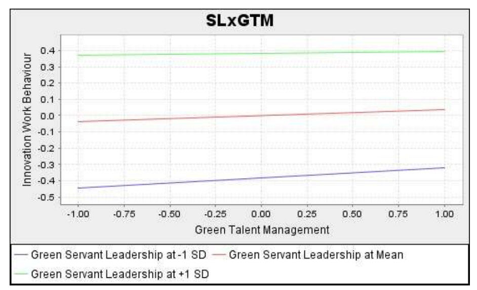
Figure 3. The Moderating Effect of Green Servant Leadership