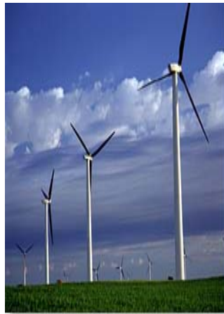
Fig.1 Large wind turbines for utility electricity generation in mid-USA.

Wind turbines convert the power in the wind into electricity. By extracting the kinetic energy in the wind, wind turbines generate mechanical power. In the past, mechanical wind machines were widely used for specific tasks, such as pumping water or grinding grain. Today, wind turbines commonly use this mechanical power to generate electricity.