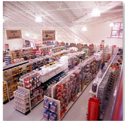
Fig. 4 A Shopping Center in Silverthorne, Colorado, USA uses natural daylighting and compact fluorescent bulbs to improve energy use.

According to the US Environmental Protection Agency's ENERGY STAR Program, lighting consumes 25%-40% of the energy used in commercial buildings and is a primary source of waste heat.