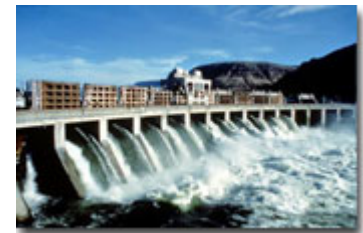
Fig.2 Large hydropower plants such as the Bonneville power plant on the Columbia River provide most of the electricity in the Northwest United States.

Hydropower is the kinetic energy of flowing water, which when captured can be used to power machinery or converted to electricity.