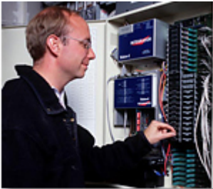
Fig. 3 Energy management system in a retail complex, Colorado, USA.

Within buildings, many systems work together and directly affect one another. For example, changes in a lighting system will have a direct impact on the energy used by the building's heating and cooling system.