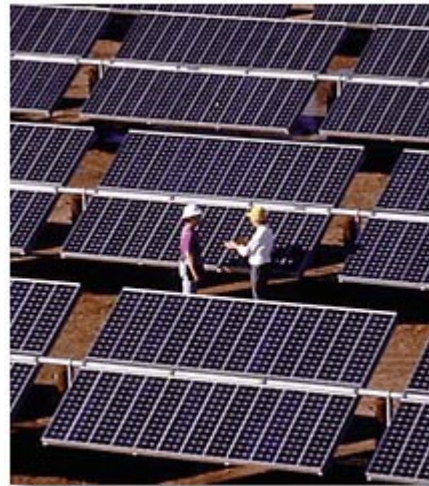
A 210-kW flat-plate PV array that is used for grid support.