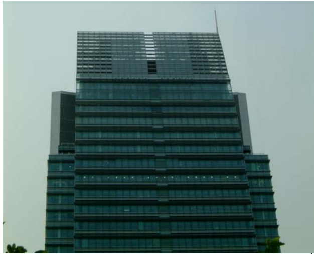
Figure 10: Photo of the BIPV system at the top part of on a building at Peking Road, Hong Kong