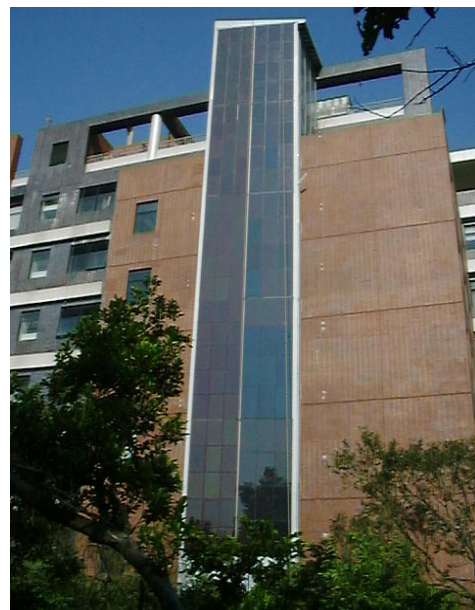
Figure 2: Photo of the BIPV system on CYC building of HKU

in the University of Hong Kong. The location of the building is by the side of hills in the Western district of Hong Kong Island, the building is an office building and the BIPV system is a grid-connected BIPV system. The system is also act as a thermal buffer to reduce the heat gain of the building from the strong sunrays during the sun setting period. The system was made from two types of thin-film PV panels; each type of panels occupied 25 \text{ m} \times 2 \text{ m} ( H \times W ) vertical area. Thin film panel has the advantages of low cost and the external appearance is similar to those normal curtain wall glass panes. In fact, the mounting of these panels in the project was exactly the same as those for normal curtain wall glass panes, and modular structure concept is used in the assembly process.