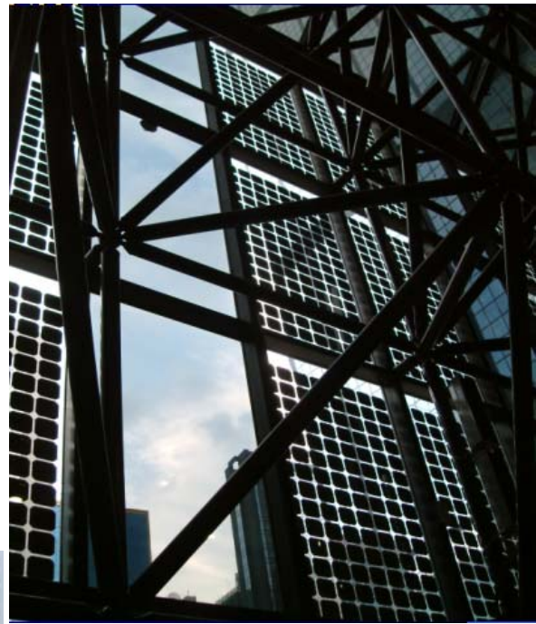
Figure 9: The interior view of the Skylight BIPV system of the Wan Chai Tower in Hong Kong