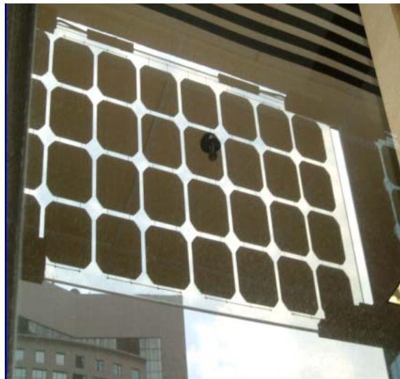
Figure 8: The interior view of the Sun Shade BIPV system of the Wan Chai Tower in Hong Kong