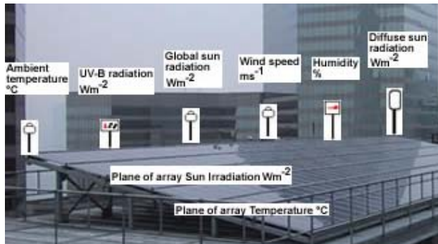
Figure 7: Photo of the Roof Rack BIPV system on roof of the Wan Chai Tower in Hong Kong (locations of some of the monitoring sensors are indicated)