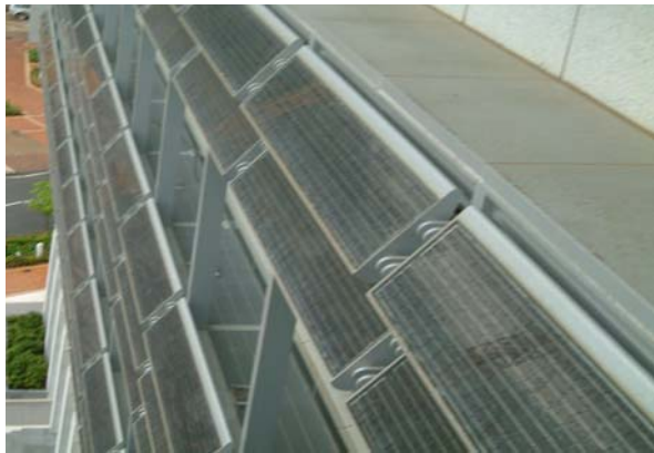
Figure 4: Photo of the BIPV system on Building 2