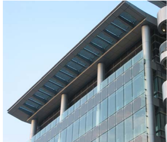
Figure 6: Photo of the facade and roof of BIPV system on Building 5