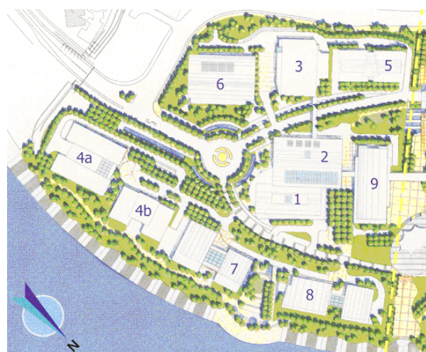
Figure 3: Block plan for HKSP Phase 1 to show the location of Buildings

The PV systems for HKSP phase 1 with a total capacity about 198kW to grid connection were planned to be installed in eight buildings. Details of BIPV installed capacity are shown in Table 1.