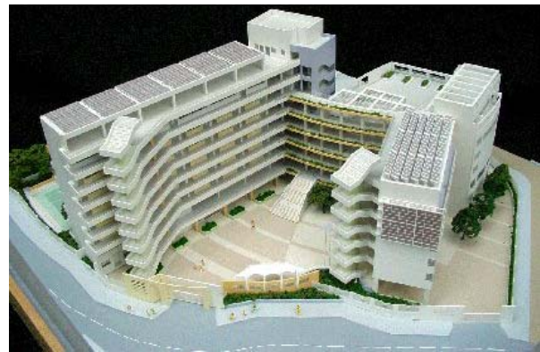
Figure 11: Computer simulated image of the completed Ma Wan Primary School with BIPV systems on it