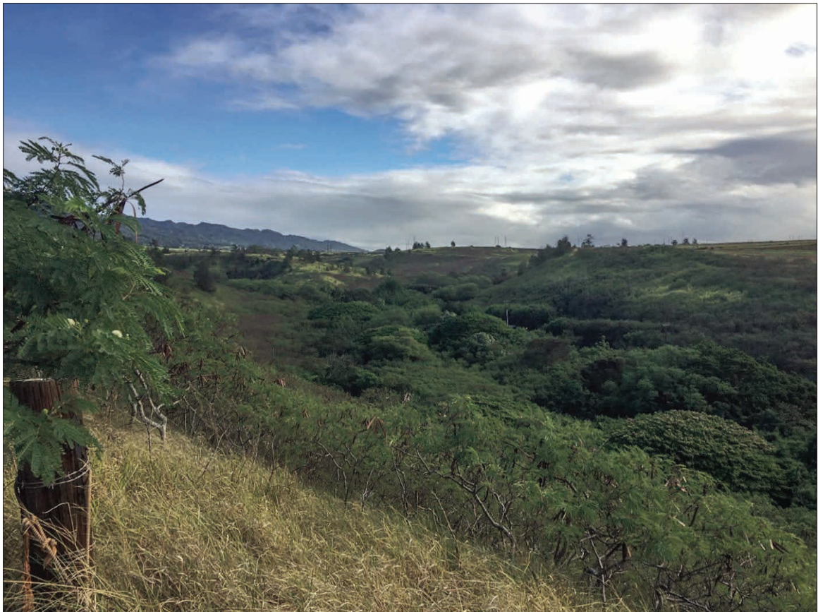
Figure 1. Overview of Honouliuli National Monument, view is northwest towards Compounds I, II, and III, from UH West O‘ahu Access Road; view in foreground is Compounds V and VI. May 2017.

Excavations of the POW mess hall foundation in Compound I were conducted using standard 1x1 m test pits with 10 cm arbitrary levels. Each unit had its own temporary datum located at the northwest (or highest) corner of each test pit. Standard archaeological techniques were applied to excavate the test pits with hand tools such as hand-picks, trowels, and shovels. All sediment was screened through 1/4-inch (6 mm) mesh hardware cloth. All artifacts were collected and bagged by provenience (site, compound, test pit, level/depth, etc.).