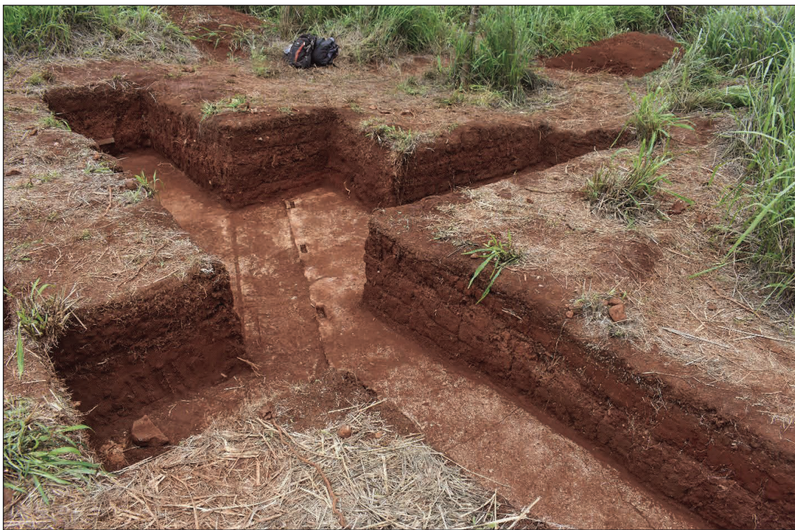
Figure 5. Completed 2019 Excavation of Feature I-7, facing southeast.

of Compound I. Associated with this mess hall is a single, relatively small garbage incinerator (Feature I-5), which is approximately 12 feet long, 3 feet high (although severely degraded) and over 4 feet wide.