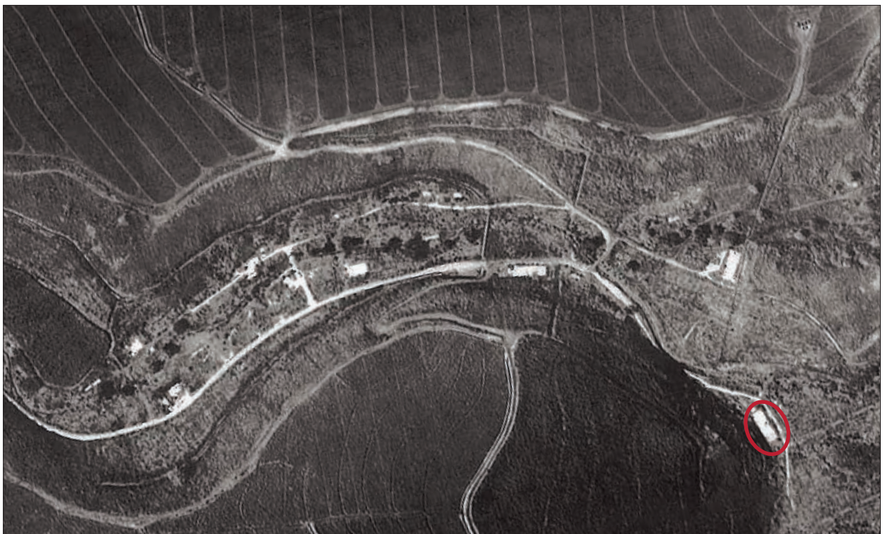
Figure 3. April 1948 Aerial Photograph. Feature I-7 is circled in red.