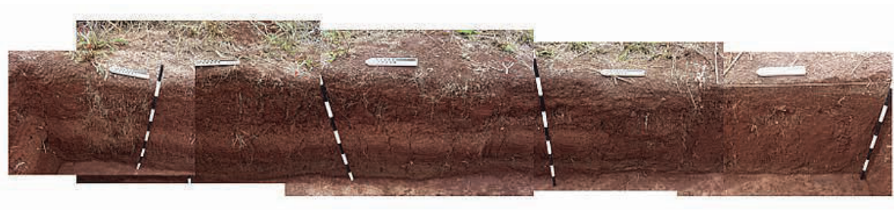
Figure 4. Photomosaic of Section of Feature I-7 – East Wall, Trending North (left) to South (right).