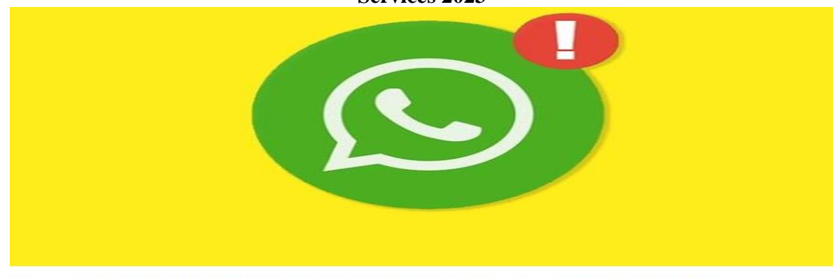
Figure 4. Consultation Information on the Tuban District Population Administration Services 2023

Layanan KLINIK KONSULTASI via Whatsapp +62811307764