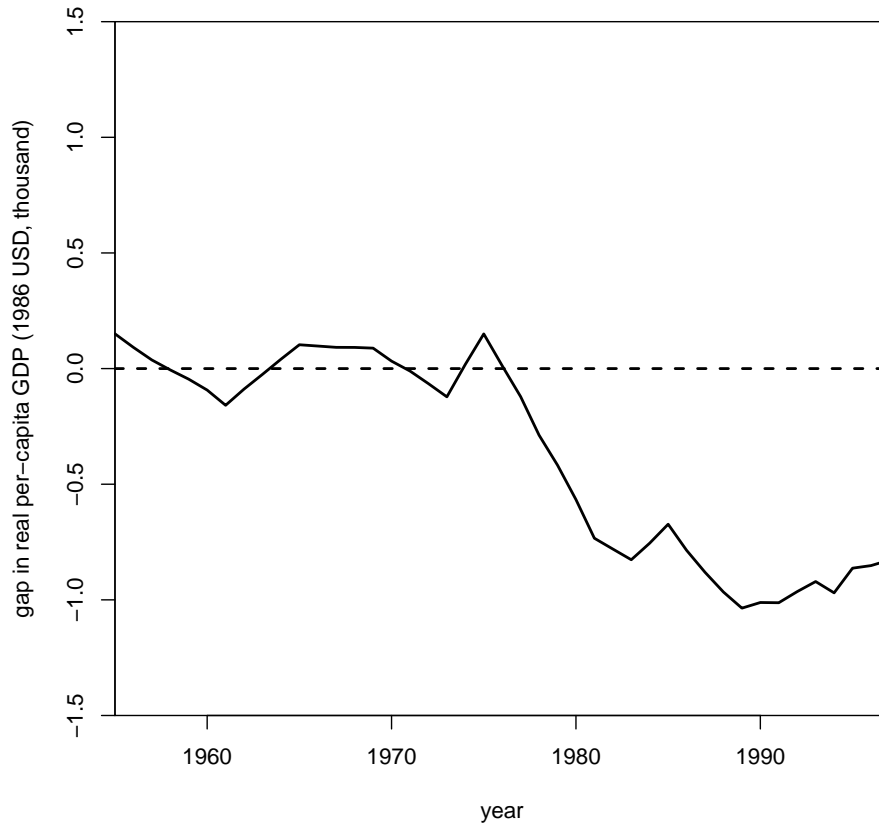
Figure 2: Per-capita GDP Gap between Basque country and synthetic Basque country.

grows at a much lower rate than in the synthetic Basque country suggesting a large negative effect of terrorism on Basque GDP.