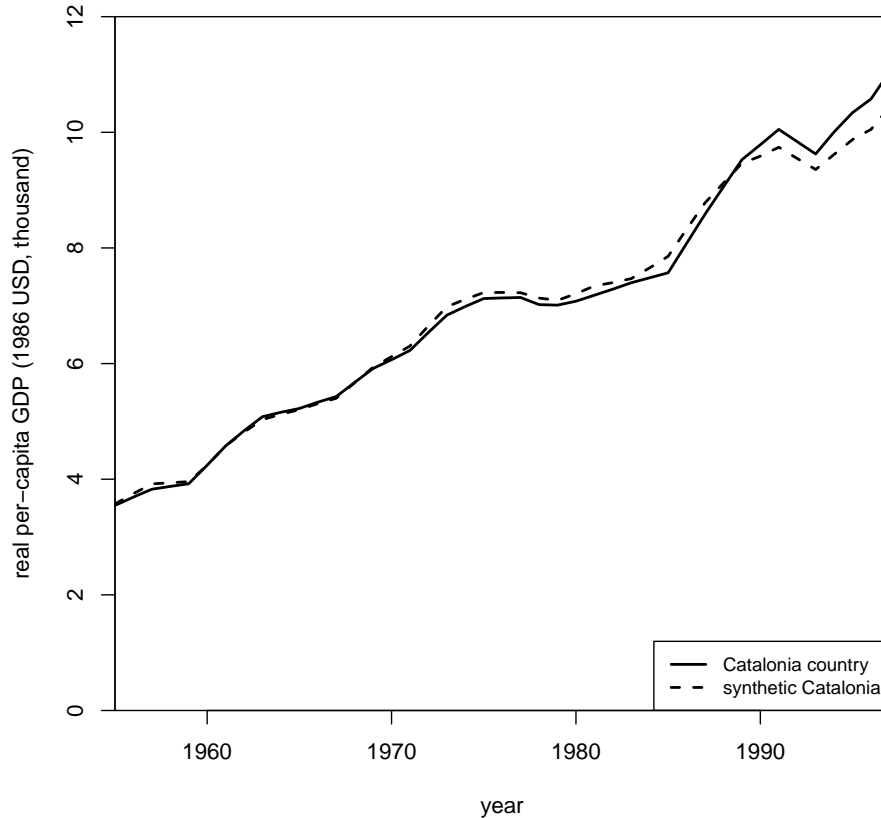
Figure 3: Placebo Study: Trends in Per-Capita GDP: Catalonia vs. synthetic Catalonia.

one must re-run dataprep() , this time setting the treatment.identifier to 10 and the controls.identifier to c(2:9,11:16,18) , since Catalonia is region number 10 in the dataset. 19