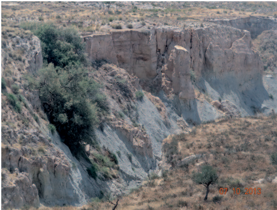
Fig. 2.- Slope movements in the epicentral area. Rambla wall cracking and collapses in the Barranco Hondo.

Fig. 2.- Procesos de ladera en la zona epicentral. Agrietamientos y colapsos en Barranco Hondo.