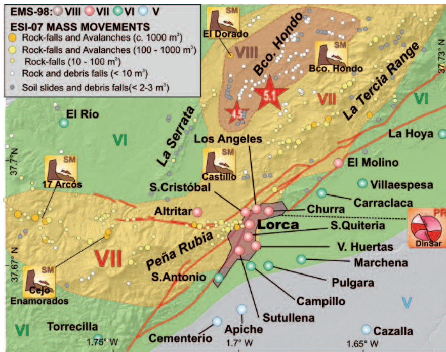
Fig. 1.- Intensity zones of the Lorca 2011 Earthquake based on ESI-07 earthquake environmental effects analyzed in this study and EMS intensity data from the IGN (2012). (Colour figure on the web).