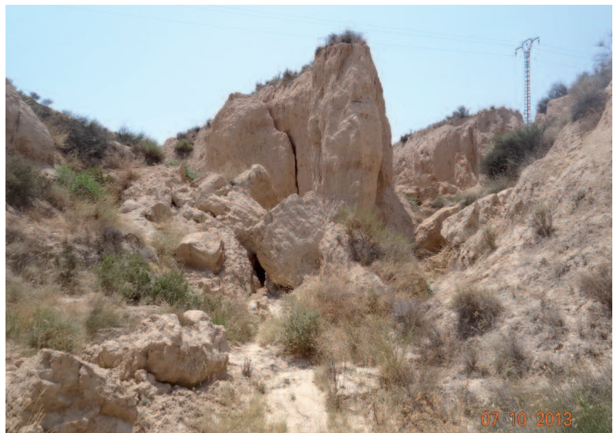
Fig. 3.- Collapse of rambla valleys in the epicentral area (Barranco de El Dorado).

Although there was no record of surface rupture during the event (IGME, 2011), DinSar and GPS analyses following the event identified relative coseismic uplift of + 3-4 cm in the upthrown block of the Lorca-Alhama de Murcia Fault (Frontera et al. ,