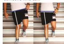
4a. Poor control of hip and pelvis. 4b. Improved control of hip and pelvis. Figure 4 Walking down stairs