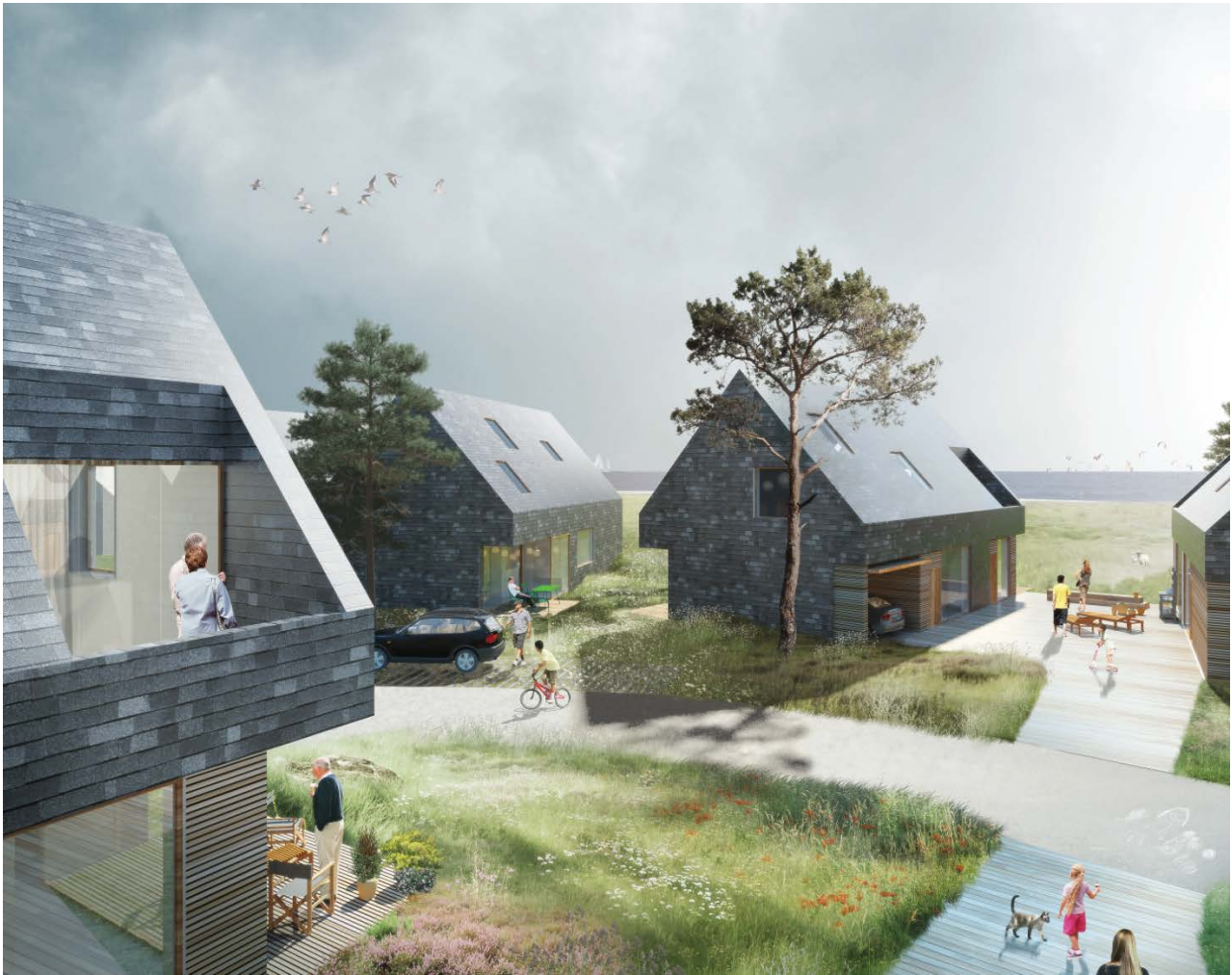
Figur 5 The private space is perceived as impetus to building up a strong community. Ringkøbing K, visual by Arkitema, EFFEKT among others.