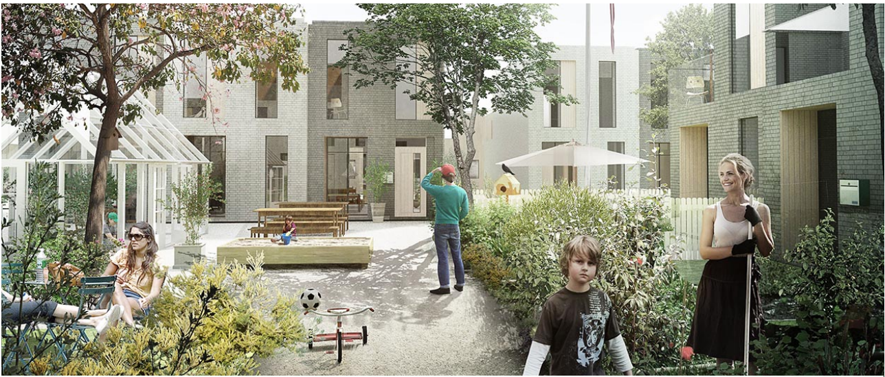
Figur 1 NærHeden is a densified “suburb of the future” for inhabitant in all ages. Promotion material.

Researcher, Ph.D., MA, Danish Building Research Institute (SBI), Aalborg University, A.C. Meyers Vænge 15, DK-2450 København SV, Phone: + 45 99402257 or mobile +45 61309634 Email: mme@sbi.aau.dk