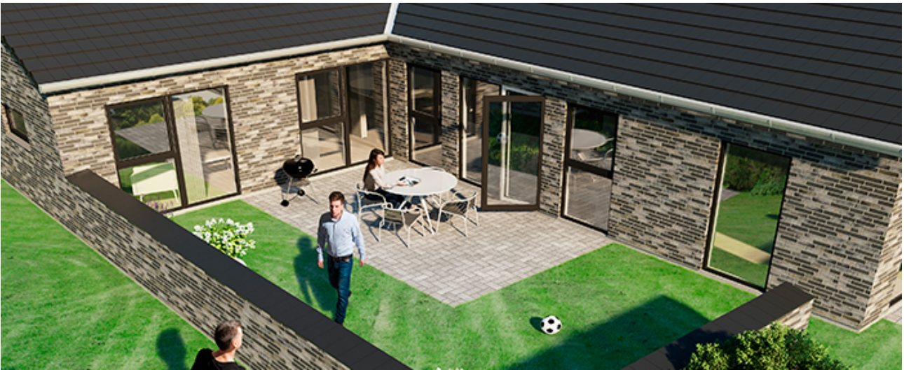
Figur 4 Ullerød on Hillerød is close to a very traditional Danish suburb. But again, the gardens are minimal and you cannot walk around your house.

children do not have to look over a large hedge to see what happens next door. I think I can give my children, what I had when I was a boy, running and playing, having a huge social life! (young dad, Hellerup).