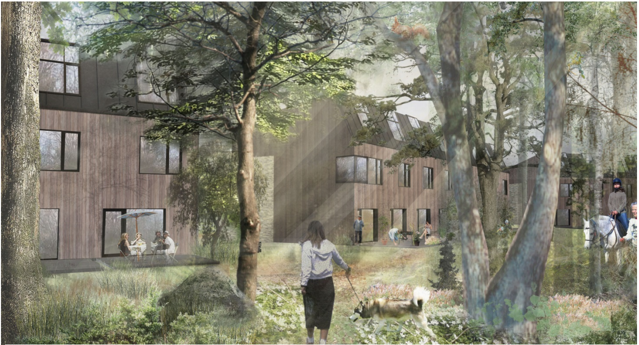
Figur 2 Nature outside your door. Not a typical Danish suburban green setting Ringkøbing K, visuals by Arkitema

this immediately implies time. (1974/1991: 43).