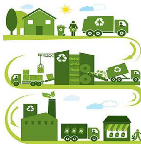
Figure 4. Renewable resources.

A proper treatment of e-waste is required so that it has no effect on human health. The most significant impact of e-waste is on human health. Developed countries have the technology to dispose of e-waste properly whereas developing countries are unable to dispose of e-waste with proper precautions and safety measures due to improper utilization of technology or lack of technology, which has direct impact on the health of local people living in that area. The best alternative to treat e-waste is by using three R's (Reduce, Reuse and Recycle). The most common effect is, after dumping into landfills; the chemical leaches into the water table. Later the hazardous chemical gets dissolve in water, affecting the agricultural land and drinking water. The contamination of water is also affecting the marine life on a very great extent.