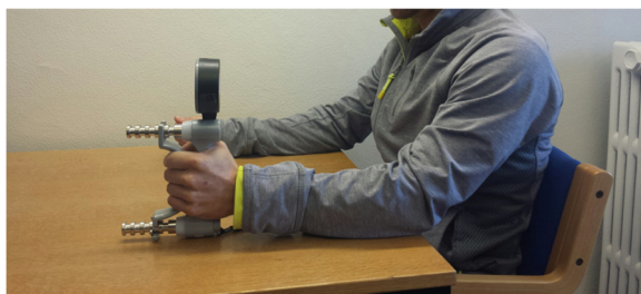
Fig. 2 Demonstration of a left hand grip strength measurement by pressing the Jamar hand dynamometer

Data are presented as mean \pm standard deviation (SD), and all statistical analyses were performed using SPSS (version 22). The dominant and non-dominant hands were analysed separately and measurements were presented as first measurement, mean of two measurements, mean of three measurements and highest value out of three measurements. For reproducibility,