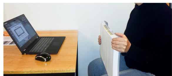
Fig. 1 Demonstration of a left hand grip strength measurement by pressing the upper left corner of the Nintendo Wii balance board

Before starting the actual tests, participants received a set of standard instructions and demonstration of the procedure. Afterwards they were seated in a standard chair (seating height 43 cm), which was used for all tests. Participants were then asked to hold the WBB with their left and right hand around the middle of the WBB with the lower face of the board towards their torso. All tests were initiated with the right hand, which held and squeezed the upper right corner. This was followed by the left hand holding and squeezing the upper left corner, as illustrated in Fig. 1. Prior to the actual testing, 2–3 sub-maximal recordings were performed. This served both as habituation and warm-up. After the warm-up, the actual tests were performed with a total of three