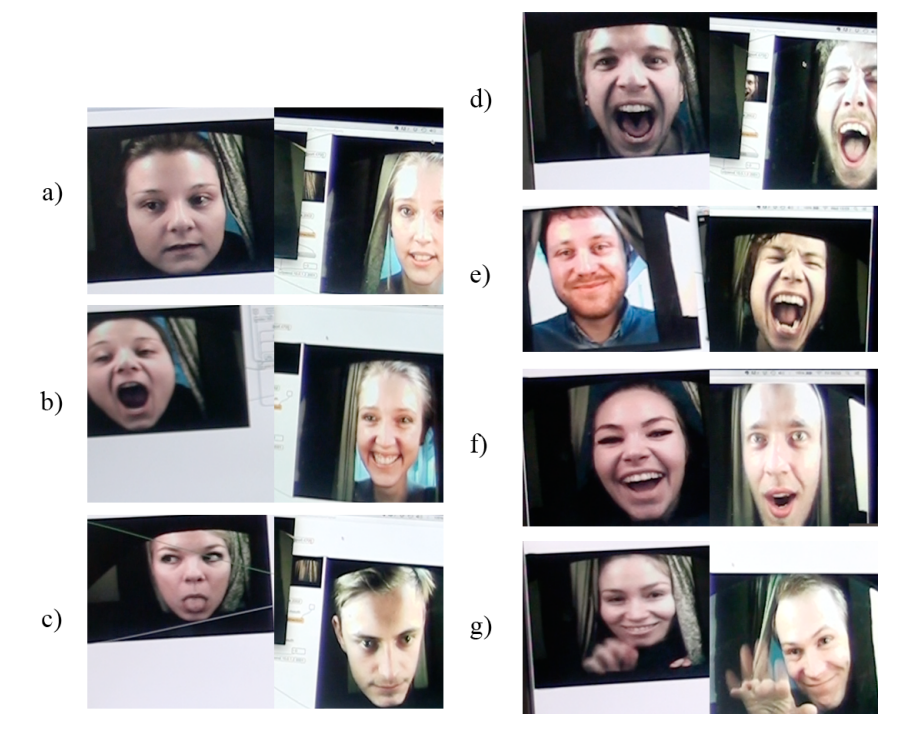
Fig. 5. Shows screenshots of interactions with the OperaBooth representing a) confusion, b) engagement, c) disconnect, d) competition, e) exploration, f) intimacy and e) added gesturing.

participant even stated: "It felt like he could smell my bad breath". A few participants stated that the musical experience made it easier to maintain eye contact when they were in control of the sounds and were able to "communicate" with each other, in contrast to the silent and doubtful parts that felt very intense and awkward. One participant even felt embarrassment towards the other because she was not able to control the voice. Observations that supported the notion of intense communication included participants looking away or even pulling their head out when laughing too loud.