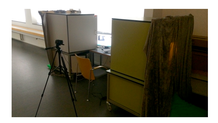
Fig. 2. Setup used at the evaluation. The two OperaBooths were set up near each other for convenience. Screens between the OperaBooths displaying faces of participants were video recorded.

Finally, the system was setup so participants could either see each in (1) a full screen mode enabling direct eye contact or in (2) a limited screen mode where participants saw each other in a window that filled approximately two thirds of the screen and was moved slightly to the left on the screen. This setup enabled a simulation of a non-direct eye contact interaction. See Figure 2 for the setup used for the evaluation.