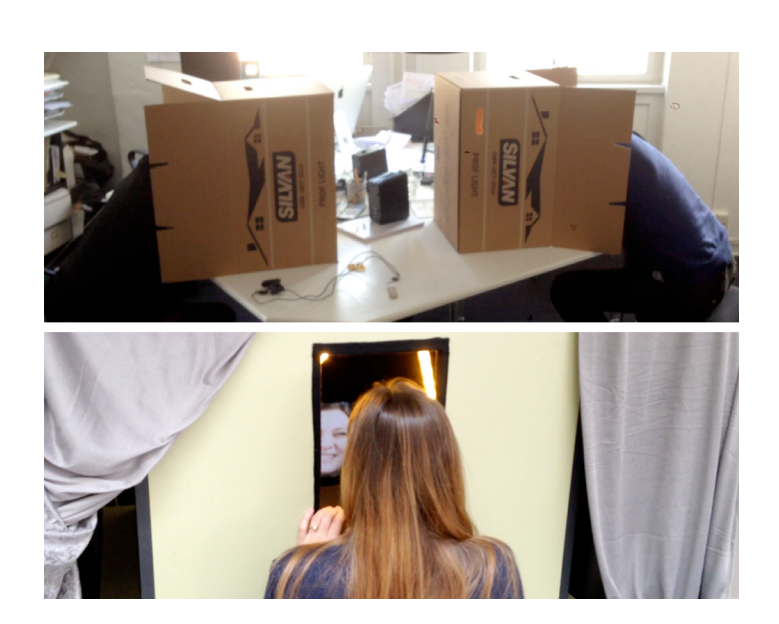
Fig. 1. Prototype 1 (top) and Prototype 2 (bottom) of the OperaBooth.