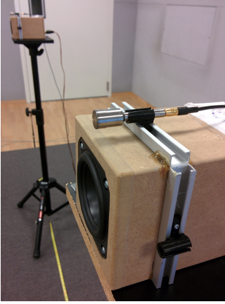
Fig. 1. A picture of the stereo setup.