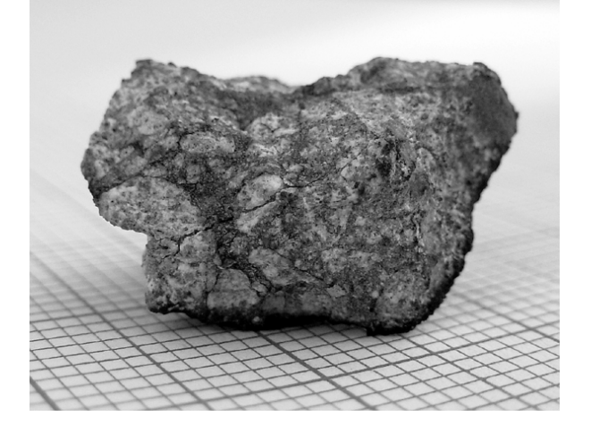
Figure 1. Piece of the Puerto Lápice eucrite recovered by the SPMN. (Square=1mm).

anonymous. We also thank the support received from Agrupación Astronómica de Madrid, and Asociación de Astrónomos Aficionados de la Universidad Complutense de Madrid. This research was partially funded by the Spanish Ministry of Education and Science.